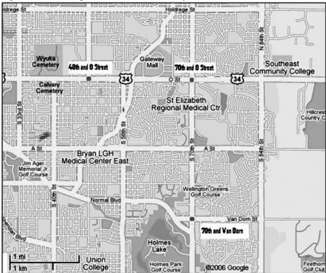
Figure 3: Location Map of Intersections Under Study

Note: *Black spots indicate the study intersection