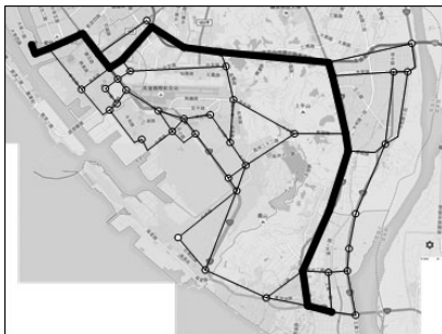
Figure 7: Scenarios 6,9