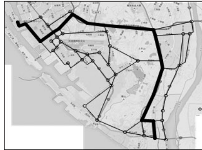
Figure 6: Scenarios 5,8,11