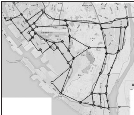
Figure 3: The Network in Empirical Analysis

The proposed approach is tested in Kaohsiung City shown in Figure 3. The network consists of 50 nodes and 144 links. The links consist of freeways, expressways, and arterial streets with real road characteristics. The origin node is China General Terminal & Distribution Corporation (CGTD) and the destination is Lin Yuan Industrial Zone.