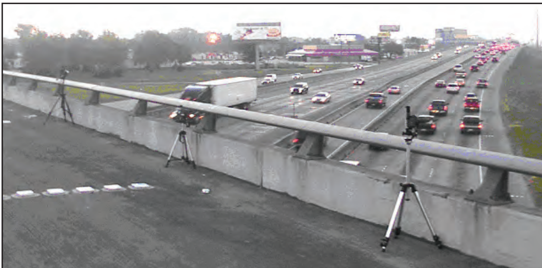
Figure 2: Recording License Plates on Northwest Freeway

It was somewhat challenging to capture these license plates while maintaining a low profile. Due to some drivers' extremely negative reaction to being videotaped, video cameras were located on Katy and Northwest Freeway overpasses and recorded vehicles traveling in the freeways below. The cameras were positioned such that the majority of travelers being videotaped would not notice them (see Figure 2).