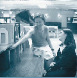
The Heart of a Librarian