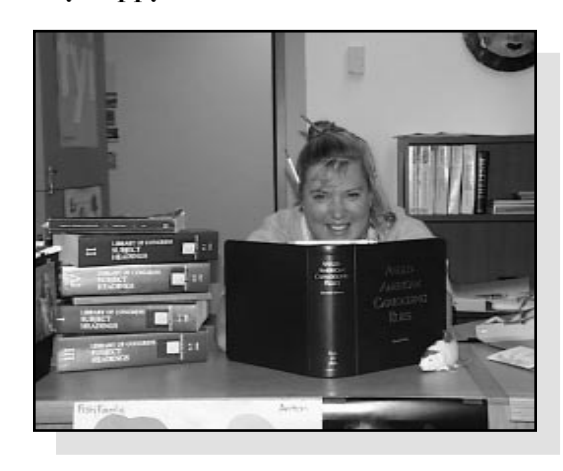
So, this is what AACR2R looks like!

500 Other interests include crafts, sewing, gardening, playing, collecting Sylvester and other cats, rescuing animals and being generally happy.