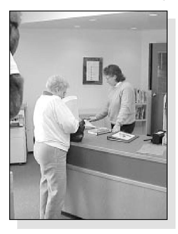
Another happy patron, satisfied with the information supplied by her helpful and friendly reference librarian.

The high school library held no allure for me. It was old and dark and the librarian was a man. Imagine