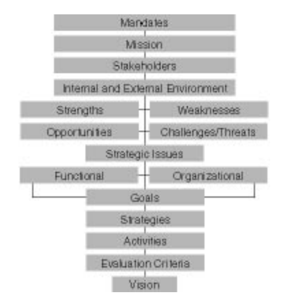
Figure 1: Strategic Planning Elements

The Task Forces met from November 1997 to March 1998 and followed a general outline addressing the elements of a strategic plan. These elements were