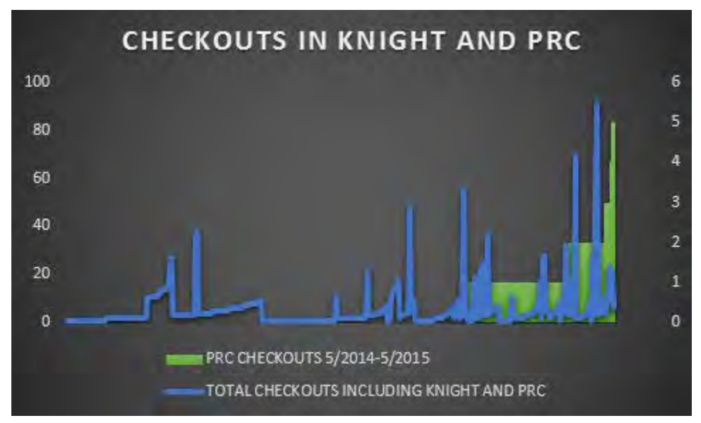
Figure 1: Total checkouts in Knight (general collection) and PRC vs. PRC alone. (Left axis "0–100" corresponds with blue Total Checkouts, Right axis "0–6" corresponds with green PRC Checkouts)

While we awaited our first wave of purchases we conducted an assessment that produced several interesting findings. A third of the temporary collection had a very low PRC to Knight (general collection) circulation ratio. That is to say the number of checkouts of a particular title in the general collection far exceeded the number of checkouts of that same title while it was temporarily relocated to the PRC. Many of these titles did not circulate in the PRC at all during the period of 5/2014 to 5/2015.