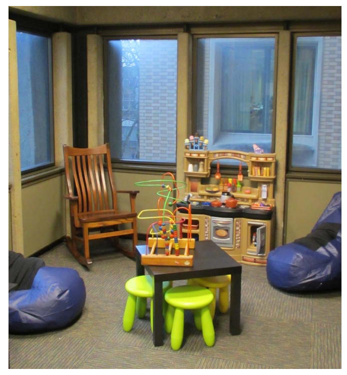
The play area includes a play kitchen, child-sized furniture, a rocking chair, and comfortable beanbags.

Child Development Center, a PSU-based preschool, with a proposal: if they provided the toys, books, and furnishings, the Library would convert an old third floor storage room into a family-friendly study space for the exclusive use of students with children. The Helen Gordon Center agreed. With assistance from the PSU Office of Information Technology, the Library added two computers and scanners for the student-parents, who gained a safe place to study without concern about wandering or bored children. The room accommodates two family groups at any given time, and students may only check out the key when their children are with them.