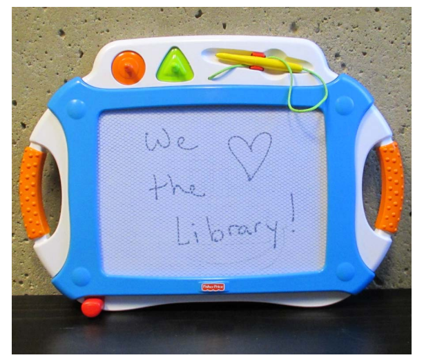
The Family Study Room at PSU Library has a small, but loyal following.

Looking ahead, we hope to see increased use of the room through additional, targeted promotion as well as a survey of the students who have used the room. We want to know how the Family Study Room meets their needs and how it could be better.