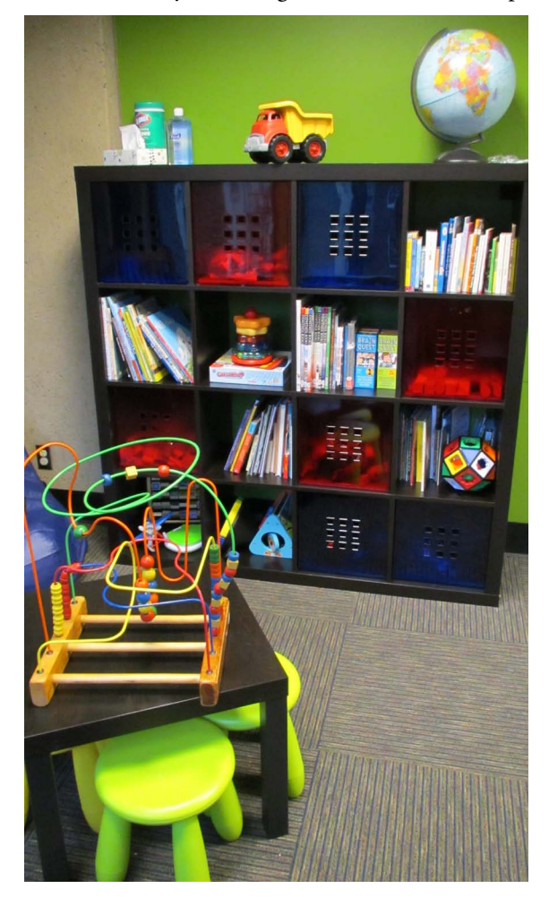
The Family Study Room offers a range of toys, books, and ALArecommended DVDs appropriate for younger children.

The recent implementation of a library study room reservation system gives us data about the use of the Family Study Room. For the time period of August 2012 through November 2013, our reservations system had 5,806 unique users, 194 of whom used the Family Study Room. We had 89 users who reserved the room more than once, with 13 users reserving the room ten or more times. The Family Room saw 571 total reservations, 2 percent of all of our study rooms. While this use isn't in line with the estimated 21.5 percent of PSU students who have children, we also know that many of those students may have older children or may not bring their children to campus.