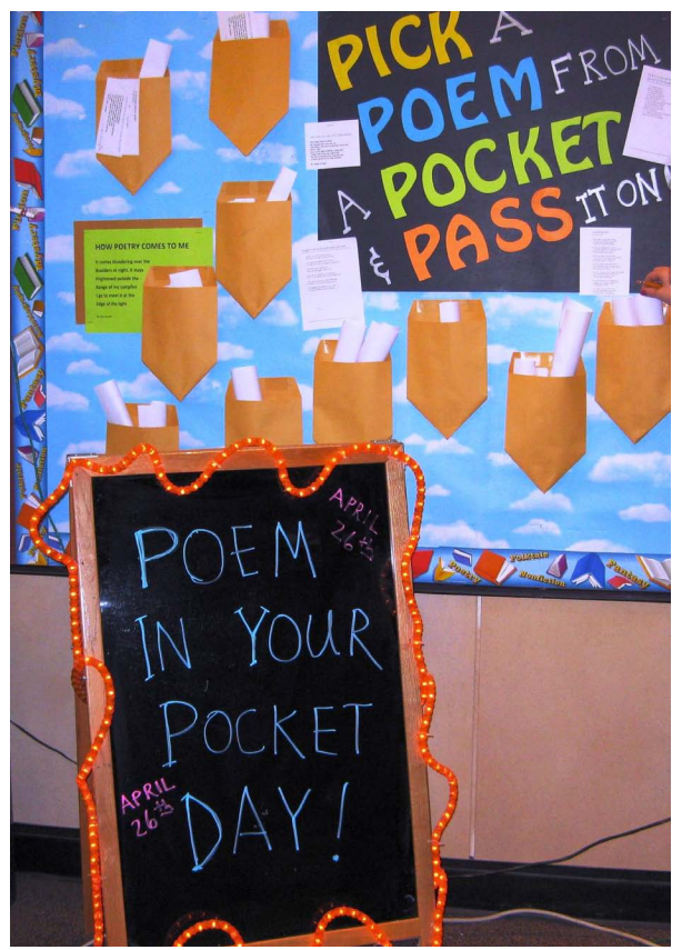
Rosemont Ridge Middle School "Poem in Your Pocket" day display

Working in the library at Rosemont Ridge Middle School, we offer our interested poets varied slants on