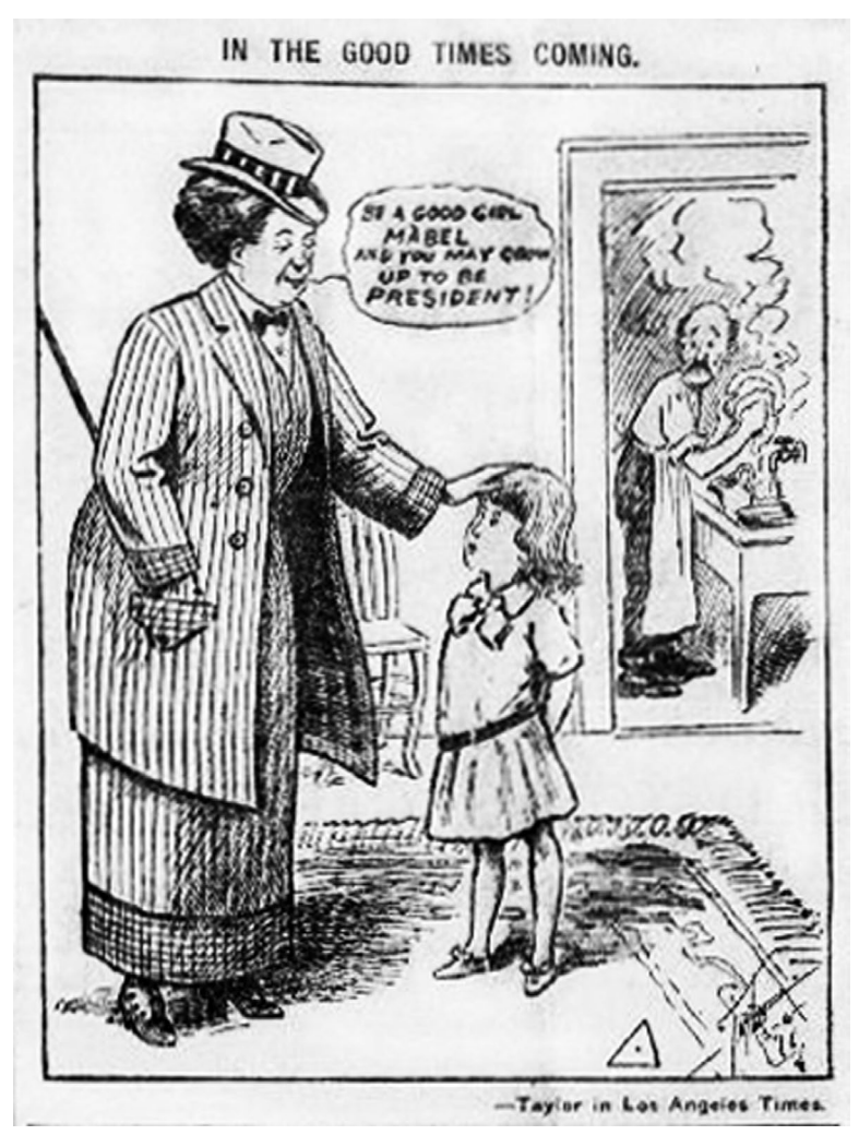
A political cartoon, published on page one of The Madras Pioneer on July 20, 1911, reveals that although much progress has been made in the past 100 years, society has remained the same in many ways.

Looking through historic newspapers online is like looking backwards and forwards in time simultaneously. It is almost impossible not to make comparisons between the content and views expressed in historic papers and the way things are today, leading to thoughts of what the future might bring. It can be shocking to see how much our world has changed,