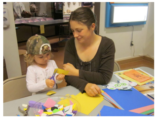
Mask-making activity.