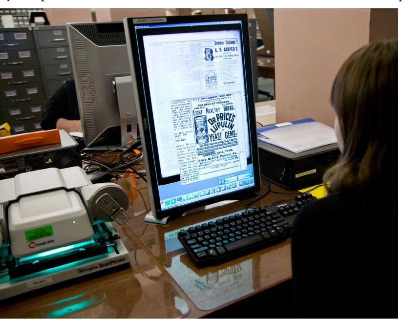
A patron uses a ScanPro machine to view historic newspaper content on microfilm in the UO Knight Library.

Up until recent years, those wishing to delve into the historical record provided by old newspapers had to venture to a physical library and scour stacks of printed pages or microfilm reels to find what they were looking for. The University of Oregon Knight Library houses an extensive collection of both historic and contemporary Oregon newspapers on microfilm through which students, faculty, and members of the public can peruse at any time during the library's hours of operation. Inter-library Loan has allowed us to share our collection with library users near and far, but with some limitations; reels can only be used by one person at a time, and access to microfilm readers continues to impede usability.