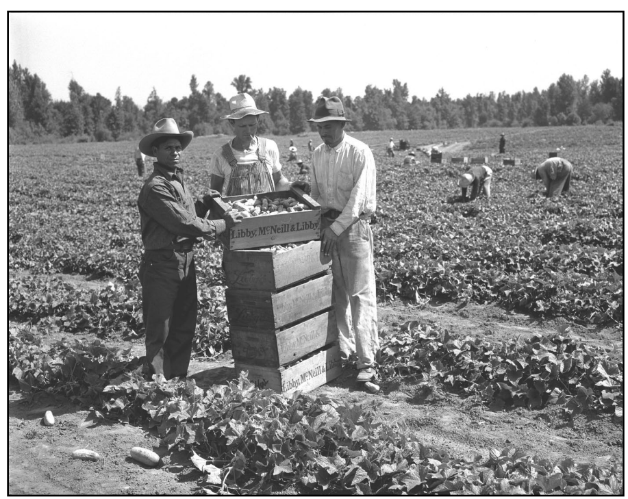
Boxes of Cucumbers

The photographs remained in the Extension Service's voluminous photo files for many years. In the late 1960s and early 1970s they were transferred to the University Archives, which had been established in 1961. The Braceros in Oregon Photograph Collection<sup>ii</sup> is an artificial collection; the original photographs (prints and negatives) were drawn from a number of our Extension Service's related photograph collections. They include the Extension Bulletin Illustrations Photograph Collection (20), the Extension and Experiment Station Communications Photograph Collection (120), the Extension Service Photograph Collection (62), the Agriculture Photograph Collection (40), and Harriet's Collection.<sup>iii</sup>