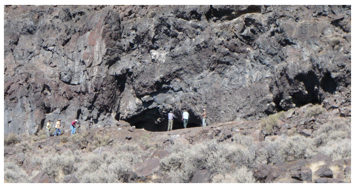
Paisley Caves