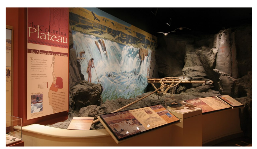
Plateau section, Oregon—Where Past is Present, MNCH.

The amazing variety of Native American baskets presents a window on the influence of local resources, ranging from the cylindrical baskets of Wasco and Wishram weavers near The Dalles to the soft flat rectangular bags of Plateau peoples in the northeast, and from the round twined trays that are signature Klamath weavings, to the coiled and imbricated baskets of the northwest, a tradition extending into Washington and British Columbia. Even projectile points, superficially similar, show differences in style over space and time, and tool stones include more chert, obsidian or basalt, depending on local availability, travel routes and trading ties. To showcase its global holdings, MNCH organizes special exhibits such as the recent Face to Face with Masks from the Museum Collections , which featured traditional masks from North America, Africa and Oceania.