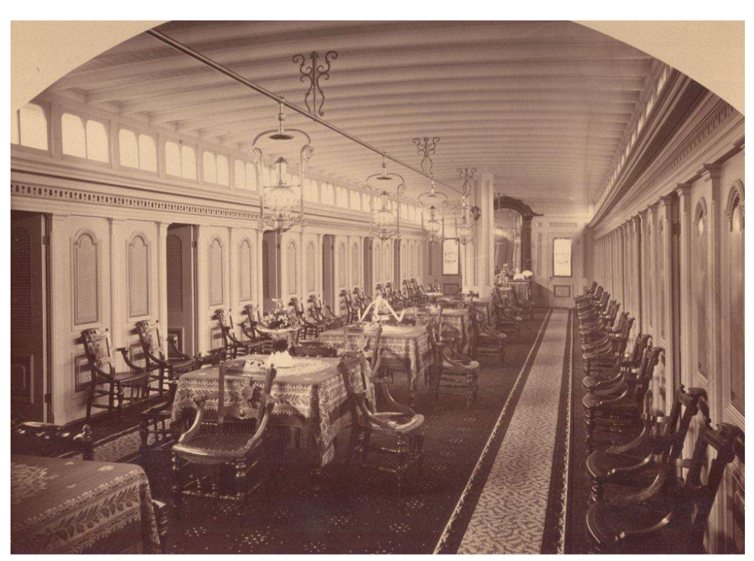
1877 photograph of the dining room on the Wide West Steamboat, which traveled from Portland to Cascade Locks and from Portland to Astoria. She operated from 1877 until 1888.

Two noteworthy collaborative projects have graced our community in the past four years, each offering a solution to long-standing problems. Through the assistance of Oregon Heritage Commission and Oregon State University Libraries, we now have high-resolution scans of the entire Pioneer Association photograph collection, and the images are available to everyone on the OSU website at http://oregondigital.org/digcol/cgdc/.