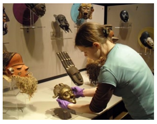
Installation of Face to Face with Masks from the Museum Collections.

MNCH utilizes its collections for teaching and outreach in a variety of ways. Last year alone, the museum presented thirteen exhibits, twenty-seven events, and 253 public programs that leveraged its collections and expertise to engage audiences of all ages and backgrounds. In addition, sixteen University of Oregon classes used museum exhibits and collections to enhance teaching and learning in anthropology, geological sciences, environmental studies, classics, landscape architecture, arts and administration, and human settlements and bioregional planning. Tours for the K–12 audience also utilize items from the MNCH's anthropological collections. For example, 3rd–5th grade tour groups participate in an "Oregon Archaeology Detective" activity, during which students investigate artifacts on display and handle teaching specimens and replicas while exploring the environments and Native peoples of Oregon. Students in 6th–12th grades become "CSI" (Cultural Scene Investigation) detectives as they inspect artifacts and consider oral traditions to reconstruct a cultural "scene."