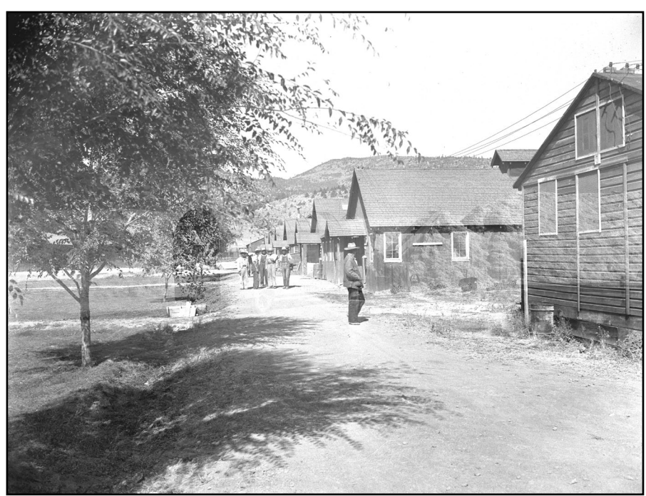
Klamath County Camp

communities, and there were little few to no organized social activities (Gamboa, p. 177–178). If the Bracero workers had been able to interact with the local community, it may or may not have been welcoming. Community support for the Mexican labor forced fluctuated, as evidenced by numerous newspaper articles which sometimes stating that hiring non-locals was unpatriotic while and at other times praising the Bracero Program for the needed labor assistance. In order to promote the program and assuage the fears of the community, the Extension Service in charge of the program created printed propaganda materials and even radio shows to champion the Bracero Program. It was in part due to these efforts that we now have a printed and photographic record of Braceros in Oregon.