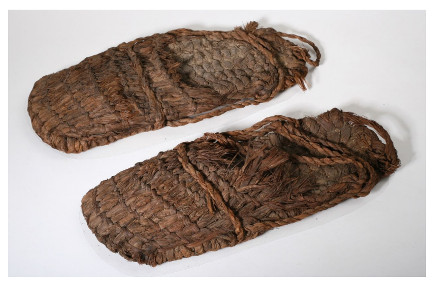
Fort Rock sandals.

he University of Oregon Museum of Natural and Cultural History curates one of Oregon's most significant collections of Native American historical and archaeological artifacts, which is comprised of more than 300,000 objects, spanning 15,000 years. The Oregon Legislature officially established the anthropological collections in 1935. They were integrated into the Museum of Natural History (now MNCH) in 1936, making