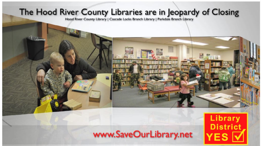
Ad for Save Our Libraries.