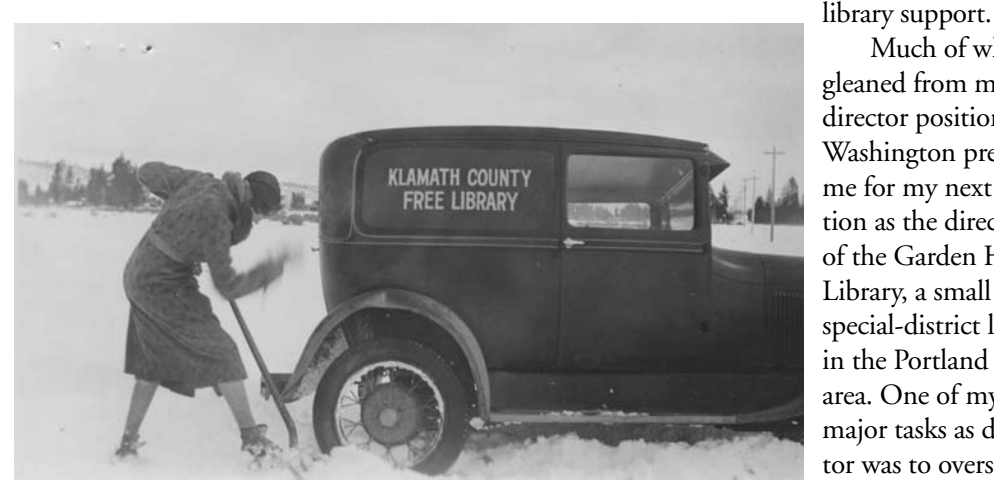
Snowbound bookmobile at Sprague River, 1932. The librarian of the Klamath County Free Library's bookmobile shovels snow.

The local politics imbued in the governmental entities under which libraries exist are daunting at best. I realized I was in no way trained or prepared to attend city council meetings. Again, my MLIS education did not prepare me for the importance of managing the inner workings of community politics. If a class in the politics of local and state governments is not part of your MLIS program's profile, request it, or at the very least, educate yourself. Attend the public city council meetings and local library board meetings in your community. Familiarize yourself with the codes regulating libraries and with the structure of your local library's fiscal agent. It's also important to recognize and develop critical relationships with local community groups such as the rotary club or chamber of commerce. A network of local, invested stakeholders is essential for fundraising and future