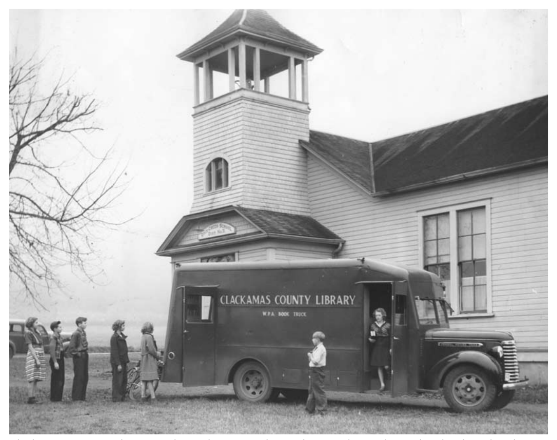
Clackamas County Library Book Truck, circa 1940. Students at the Rock Creek School are lined up to enter the county book truck funded by the Works Project Administration.