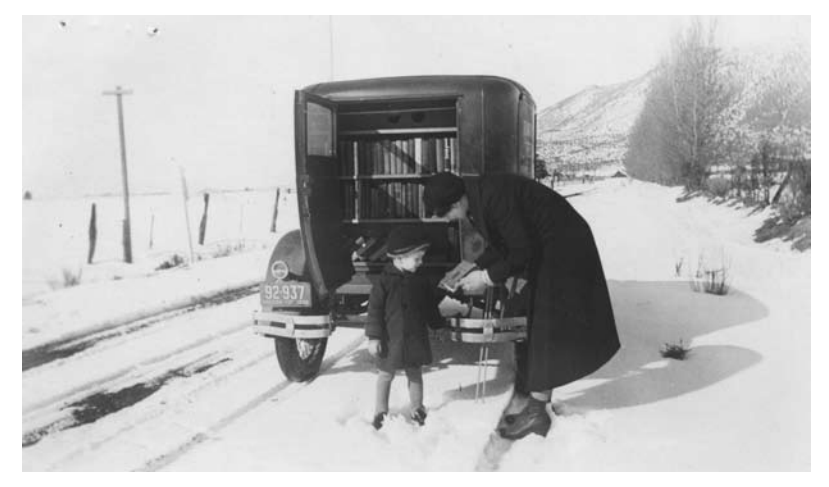
Klamath County bookmobile on rounds, 1932. A librarian helps a child choose a book from the Klamath County Free Library's bookmobile as the bookmobile makes its rounds on snowy roads. Bookshelves are visible through the open back doors.

Acceptance into Emporia State University's SLIM-II distance program in the summer of 1997 struck me as a gift. I had been working in libraries for years, but had never been in a position to at-