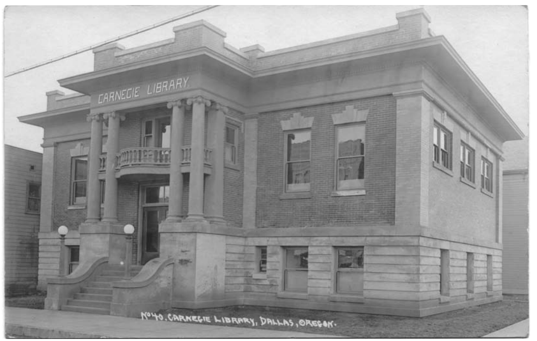
Carnegie Library in Dallas, Oregon, circa 1912. The city of Dallas received a grant of $10,000 in December 7, 1911, for construction of this library.

At the same time as these developments were taking place in Portland, Andrew