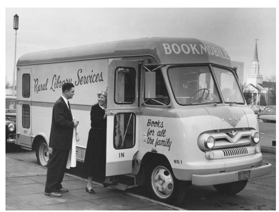
Oregon State Library's rural services bookmobile, 1958.

Any history of a library must address the library's building, its original design and construction, and any additions or modifications. Fortuitously, the Portland architect the Corvallis City Council selected to design the library building in 1931 was Pietro Belluschi, who would become one of the greatest American architects of the 20th century. At the time, he was head designer of A.E. Dovle & Associates, the most influential architectural firm in Portland. Belluschi had just finished designing the Hauser Library at Reed College and, thus, was a logical choice to design the Corvallis library. The Corvallis library was a much more modest-sized building than the Reed library, but according to Belluschi's biographer, "Its distinction lay in the warm yet dignified character, simple geometric form . . . [and] subtly textured brickwork" of the building as well as its especially-attractive open-beamed interior (Clausen 1994, 72). As Belluschi's reputation grew nationally so did the architectural importance of the many buildings he designed in Portland and elsewhere in Oregon, including the Corvallis library. In spite of several proposals to move the library from the Belluschi building, major addi-