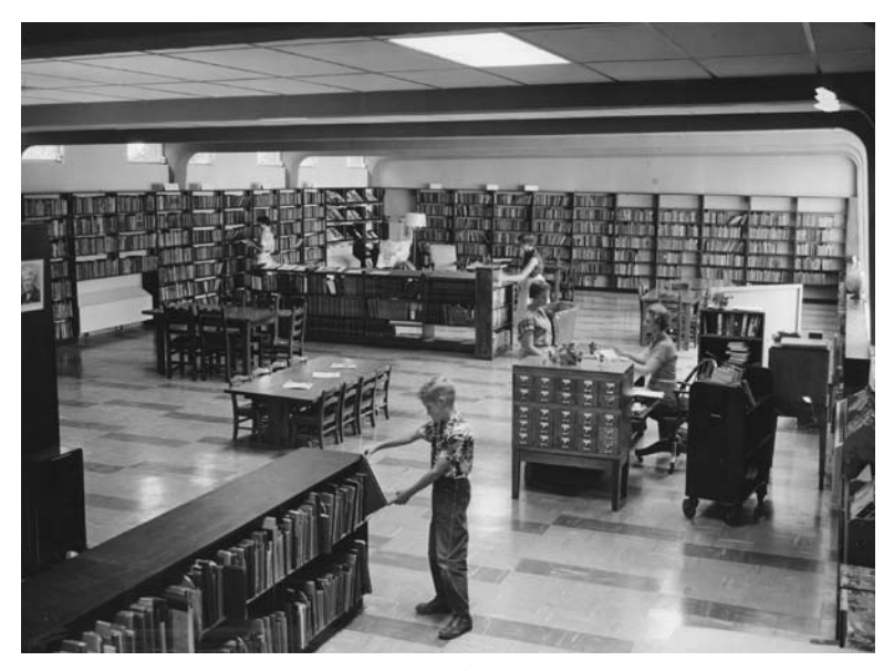
Lake County Library in Lakeview, 1954. This interior view of the Lake County Library shows the children's area in the foreground with adult books and reference in the background.

The Oregon Library Association was founded in 1940 at Timberline Lodge.