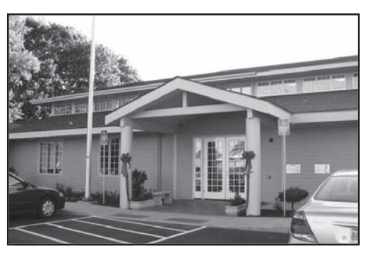
The Stayton Public Library just held their grand opening following a 7,500 square foot expansion.