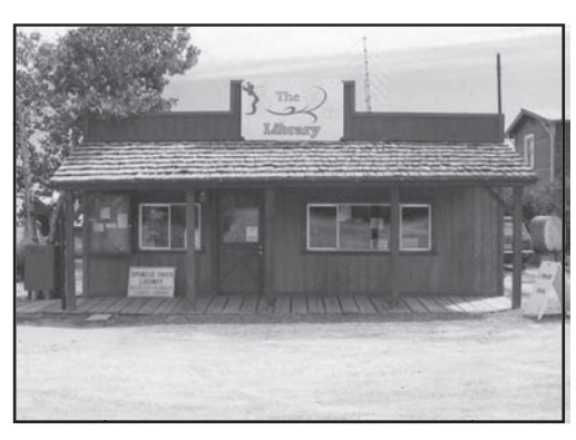
Sprague River Branch