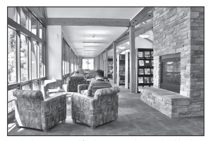
New books, magazines and fireplace seating at the Estacada Public Library.