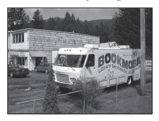
Photo of the Linn Library League Bookmobile that operates in Linn County (for more information about the Linn Library League please visit www.linnlibraryleague.org). It is funded by grants and is independent of any library system. In this photo it is stopped at the town of Cascadia.