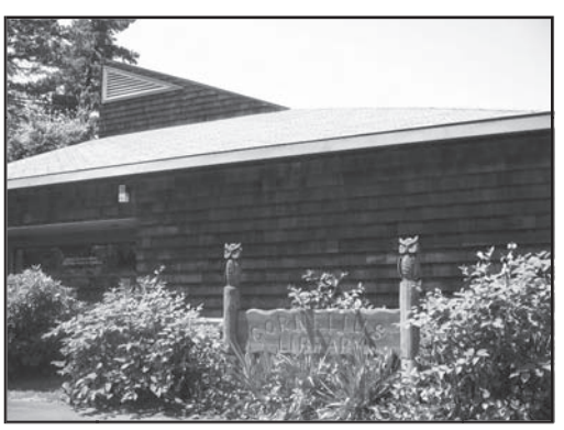
Cornelius Public Library

The Library occupies a 3,025 square foot area inside the City Hall and has a collection of approximately 21,500 items. The Cornelius Public Library is a city li-