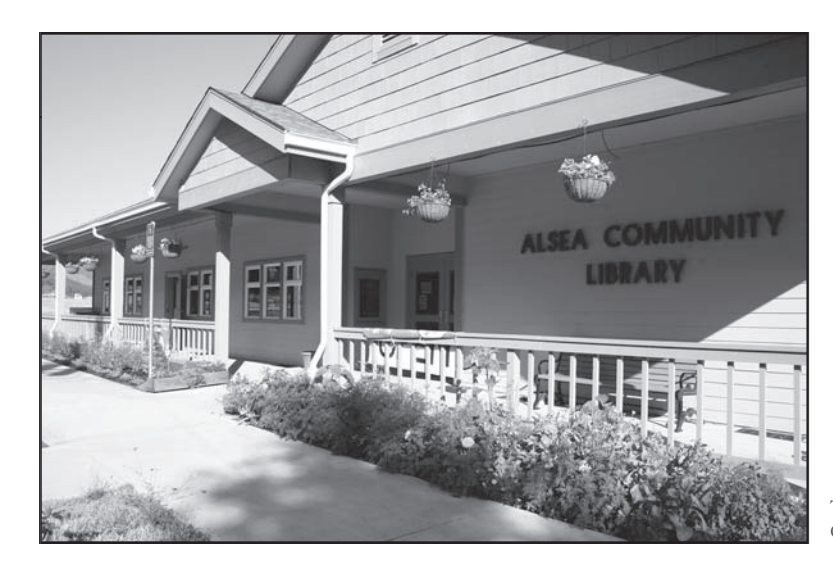
The Alsea Community Center Library

Hooray! Oops, that's not the end of this story. Now ACE, a local nonprofit whose board of directors is made up of volunteers, farmers, local small business owners, artists, teachers, and retirees, owns a lovely 4400 sq. ft. building. ACE has an Inter-Governmental Agreement with Benton County and the City of Corvallis for operation of the branch of the Corvallis-Benton County Public Library in the building, so those privileges and responsibilities are clearly delineated. Like any homeowner, ACE will be doing repairs, paying insurance, replacing light fixtures, repainting, and other maintenance, for the entire (hopefully long) life of the building. There is currently a small maintenance fund, but not an amount that will generate enough interest to pay for upkeep. If ACE (ah, hindsight!) had built a small percentage of the building cost for future maintenance into the overall amount requested from all construction grants, we would be closer to having a solid long-term maintenance nest egg. Currently we are soliciting funds in the form of yearly pledges that we can count on from "Champions of the Alsea Library." So far, the response has