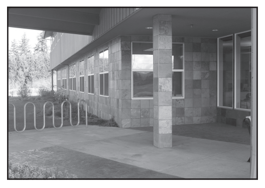
Outside of the Grand Ronde Tribal library.

The Tribal Library has one full-time staff, the Librarian, which is funded by the Tribe. We have one part-time staff, the Library Aide, which is funded by an IMLS Native American Library Services Basic Grant. We also have two volunteers, one who works at the library on Saturdays and one who helps with special events and displays. The library is open eight hours per day Monday through Friday and four hours on Saturday.