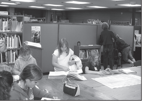
A school visit to the library.

The diversity of the library's resources mirrors the diversity within the Tribe. For example, the elected officials who make up the Tribe's governing body include a heavy equipment operator, a high school teacher and basketball coach, the owner of a construction business, a high school Indian Education Program coordinator, a mental health specialist/therapist, a nurse practitioner, and a homemaker, who in her spare time helped convince the United States Congress that the Coquille deserved to be recognized as a sovereign nation.