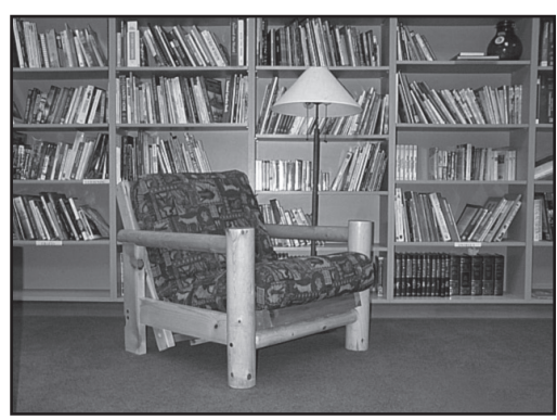
A comfortable and quiet place to read with easy access to books.