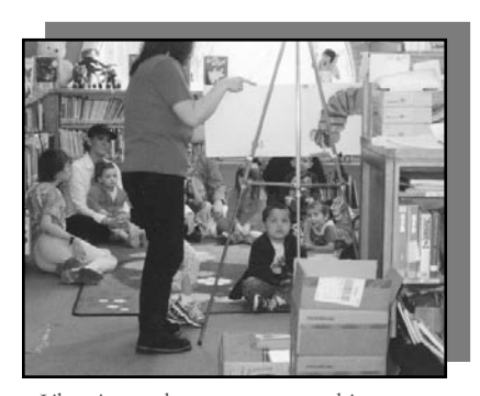
Libraries and parents are working together to give children a love of libraries and reading.