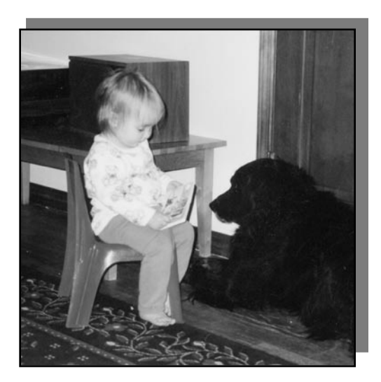
Children model the actions of their parents.