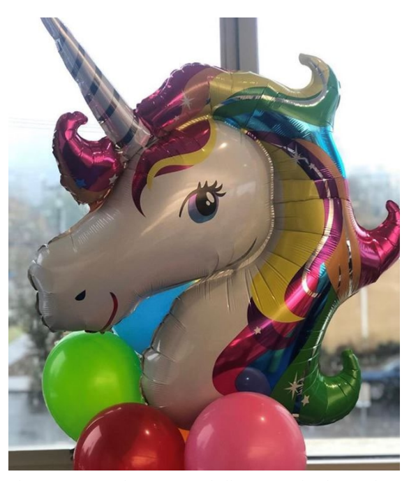
The exquisite rainbow unicorn balloon poses by the window during the Teen LGBTQ collection launch party.

Another challenge we encountered was books described as LGBTQ literature that did not feature a primary LGBTQ character. While it's okay to include some of these books in the collection, our goal was to try and feature books with LGBTQ primary characters.