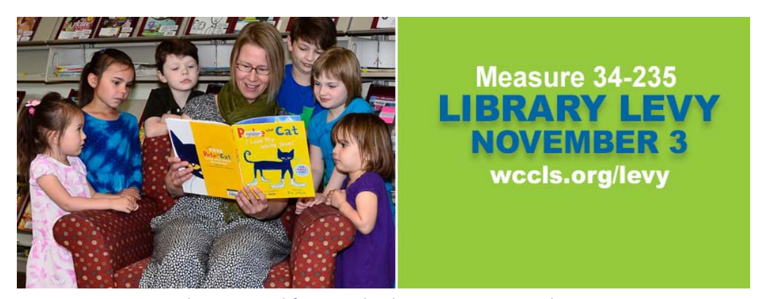
FIGURE 2: A WCCLS graphic optimized for a Facebook Page cover image, directing patrons to an informational webpage about Measure 34-235, distributed to WCCLS member libraries for use on their own Facebook Pages.

sent weekly reminders to our libraries' social media administrators to maintain the messaging campaign's momentum. Customized graphics to use for cover images [Figure 2] and organic posts to direct viewers to our levy information page on the WCCLS website were used by most member libraries and the Aloha Community Library as well.