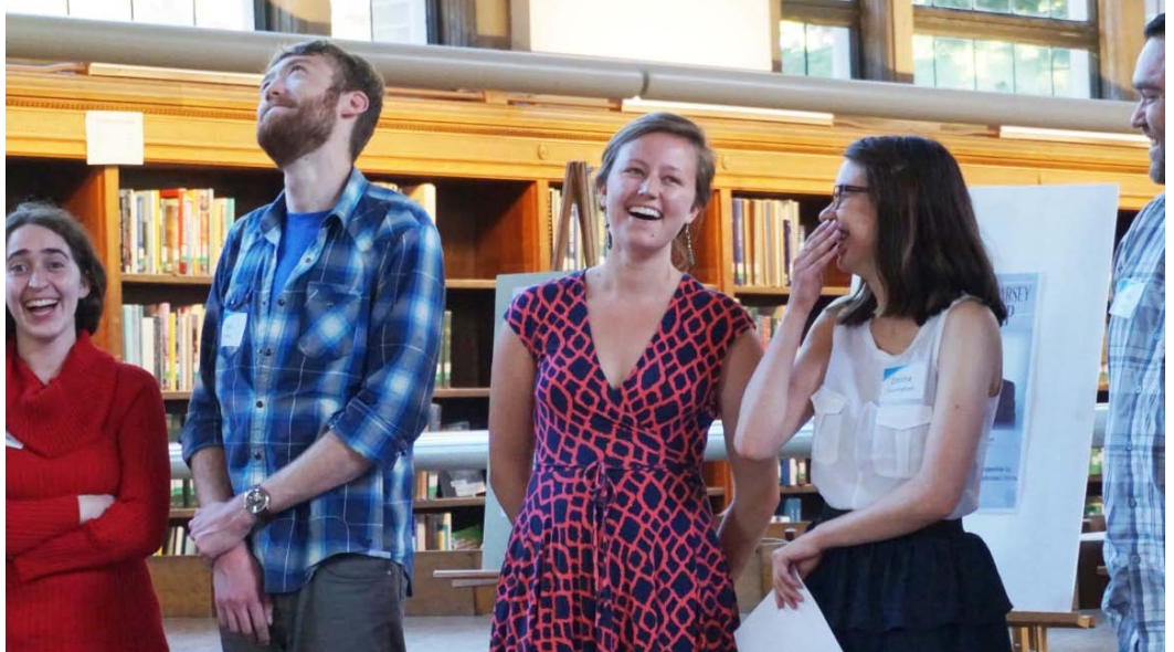
Library Student Employees being honored at the Western Libraries' annual Student Celebration, Spring Quarter 2015.