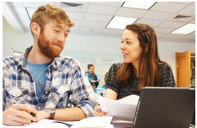
Students studying in a workshop classroom, a space created to support interactive and collaborative learning.

Actively engaged in a wide variety of teaching and learning activities, Western Libraries is committed to supporting the needs of our students, our faculty, and our community of learners. Through offering access to customizable interactive workshops that utilize modern pedagogies, personalized collaborative instructional sessions involving multiple literacies, individualized research and writing support both for students and for faculty, specialized expertise in a variety of subject areas and disciplines, access to primary sources, archival materials, rare and special collections, and materials related specifi-