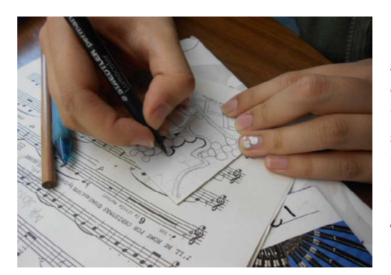
Close up of a Zentangle.

I wanted to see the program open up to anything in the "arts." So I approached people at the Coos Art Museum who directed me to the Bay Area Artists Association. I shared my idea with the assistant Directors of both the Coos Bay and North Bend Public Libraries. I was looking to tap into the interests of the high schools fandom community. Students talked excitedly about Enochian, Gleeks, Whovians and other groups they followed. That did not pan out the first year, but this year students stepped forward to present. They advertised their session as a Fandom Gathering. The fandom sessions doubled participation the first night.