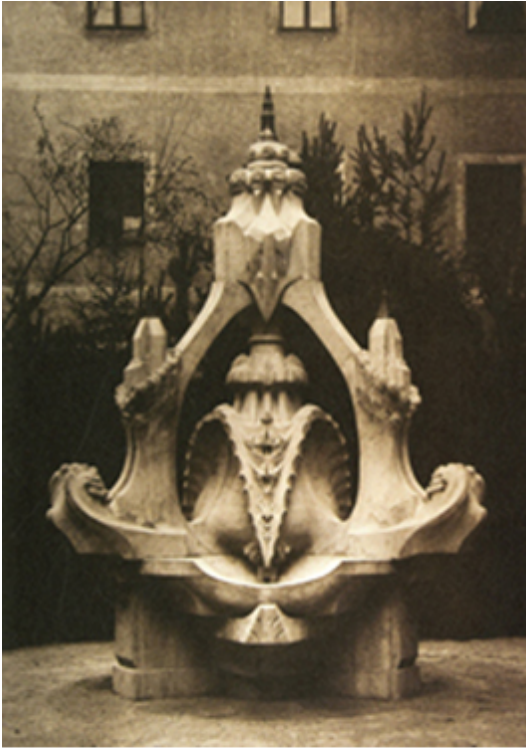
Figure 1. Hermann Obrist Fountain, Limestone, approximately 630 x 390 cm, ca. 1910-12. Photograph taken in courtyard of the House of Art and Crafts in Munich in December 1912, Museum für Gestaltung, Zürich