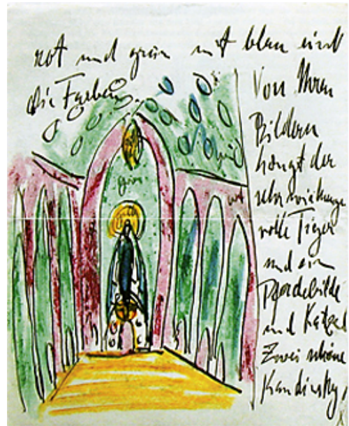
Figure 8. Ernst Kirchner Drawing of Sonderbund Chapel decoration by Kirchner and Erich Heckel in letter to Franz Marc, 1912, Ink and watercolor on paper Germanisches Nationalmuseum Nürnberg, Deutsches Kunstarchiv Nachlass Marc, I. C.

Marc showed three works in the Sonderbund Exhibition, all paintings of