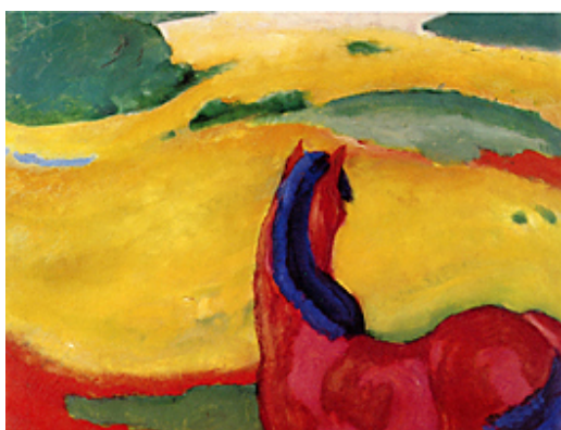
Figure 11. Franz Marc Horse in a Landscape, Oil on canvas, 85 x 112 cm Museum Folkwang, Essen, 1910

contemplate the soul of the animal to divine its way of sight. This observation should not be idle speculation, but leads us to the sources of art” (Marc, “Aufzeichnungen,” 99). He continued, saying that there are artists of the present, like Kandinsky and Picasso, who project their inner world as the subject of their work. Others, who are naturalists, paint the object, while Marc says he wishes to paint the “predicate,” by imagining how the animal feels the world. Through the course of 1910-11 his paintings seem to have been guided, in part, by this speculative effort, with his painting Horse in a Landscape of 1910 often