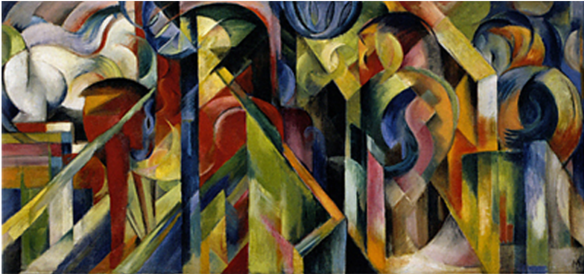
Figure 16. Franz Marc, Stables , Oil on canvas, 74 x 157 cm, 1913, The Solomon R. Guggenheim Museum, New York

While there are watercolors that respond to Delaunay's subject and radiating rings of color, it was a painting entitled Stables that pushed further into