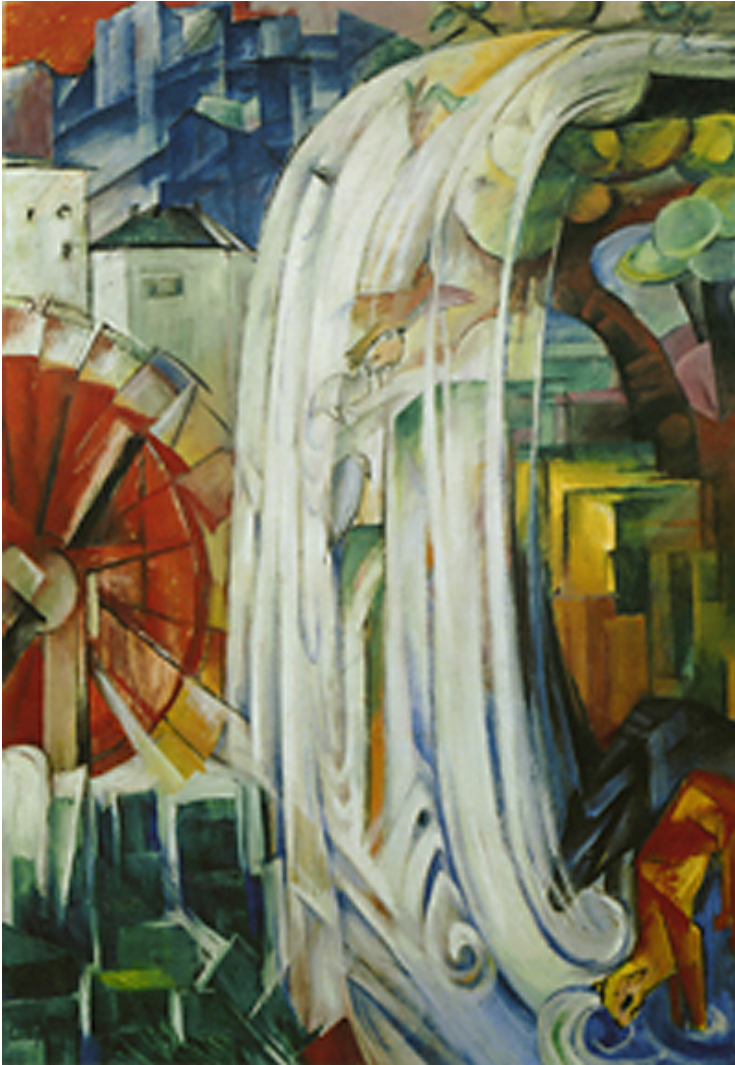
Figure 13. Franz Marc, The Enchanted Mill Oil on canvas, 130 x 91 cm, 1913 The Art Institute of Chicago

geological structures at top, bottom, and right edges. The water's fluidity in Enchanted Mill also contrasts with the three angular, frozen vectors that slice through Waterfall in Ice (Figure 14). This painting, which was destroyed during World War II, was described by Maria Marc as follows: "The color of the frozen water white and bluish-gray. Blue depths lying behind showing through. Left at the edge green, on the upper left a little black bridge on red. On the right a gold-brown trunk is intersected by a diagonal waterfall" (Hoberg and Jansen 257). As different as the states of water are in the two