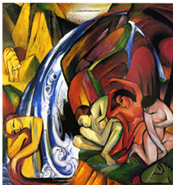
Figure 12. Franz Marc The Waterfall Oil on canvas, 164 x 158 cm, 1912 Private collection

Marées made in Marc's earlier exhibition review. Referring to the work of Vladimir Bekhtevyev, a member of the New Artists' Association, Marc wrote: "He recognized what tragically hampered Marées's struggles and spoiled Feuerbach's great ideas: both approached the representation of humans with the wholly exhausted means of the Italian Renaissance and did not dare to draw the ultimate conclusion of introducing them in their ornamental compositions as linear ornaments" (220). This conclusion was drawn by Marc as well in The Waterfall (Figure 12), a composition of mid-1912, in which the water pouring through the rocks above unites the nude female figures and landscape in an ornamental surface design (Hoberg 35-38). Symbolically, the rush of water works as a purifying force, cascading over the standing figure at lower left and sweeping her hair back into the compositional pattern. It is also a site where domesticated and wild nature join, a gathering point for both the tabby cat curled up below the female bathers on the near bank and the stretching tiger on the opposite side.