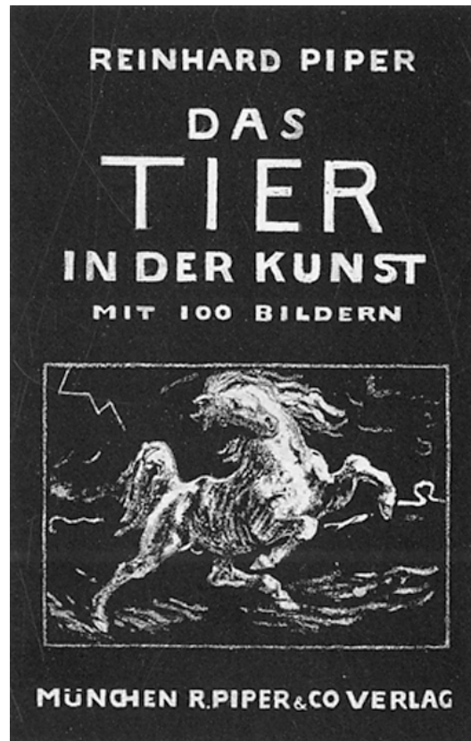
Figure 9. Franz Marc, Horse Frightened by Storm (after Delacroix), Gouache, 1910 Formerly in the Archiv R. Piper & C. Verlag, Munich 1910 (paperback edition)