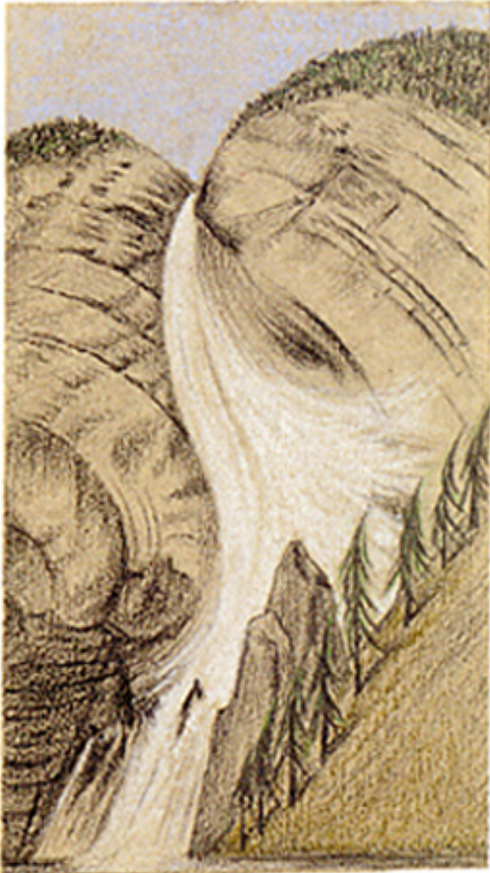
Figure 3. Hermann Obrist Waterfall in Mountains Pencil and chalk on grey-brown paper, 18.6 x 10.4 cm. Date unknown Museum für Gestaltung, Zürich

assimilation of life and art (Hand, “Embodied,” 10). Obrist believed that an alliance of science and art could produce images that expressed fundamental structures and forces within nature.