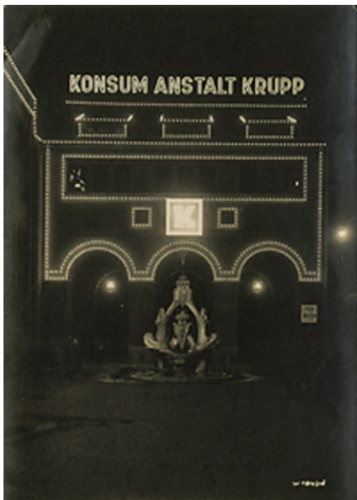
Figure 19. Hermann Obrist, Fountain, Sited by the Krupp company store on Ostfeldstraße, Essen, Photograph from before 1926, Obrist Nachlass, Staatliche Graphische Sammlung, Munich

Marc’s tragedy, of course, was that the “fire of a bitter war” caused his death on March 4, 1916, when shrapnel from a shell-burst struck his temple while he led a reconnaissance patrol on horseback near Verdun. Strangely, tragedy also befell Obrist’s fountain, whose mixture of crystalline and hypocotyl forms related closely to the organic abstraction of Marc’s late paintings and Worringer’s conception of the Gothic. Although the Werkbund Exhibition was planned to extend into Fall 1914, it closed shortly after the war’s outbreak. The fountain, like other