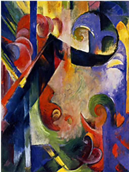
Figure 18. Franz Marc Broken Forms, Oil on canvas 112 x 84.5 cm, 1914 The Solomon R. Guggenheim Museum, New York

Some scholars consider Broken Forms to be the last painting done before Marc left for the war ( Figure 18 ). How it acquired its title is unknown, but its wording is similar to Cheerful Forms , which was, with Playing Forms , one of two large abstract paintings that were shown in and titled for the large memorial