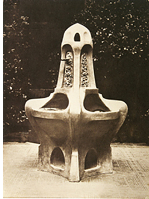
Figure 4. Hermann Obrist Plaster design for a fountain for use by people, cattle, dogs, and birds, 1901, Mounted photograph, Museum für Gestaltung, Zürich

Study of past artistic styles, such as the Gothic, which, Obrist wrote, “make the life of forces visible,” helped the artist to understand that true art expressed essences residing within nature’s construction and materials (Obrist, “Zweckmässig,” 127). Thus, he was fascinated by crockets, the stylized carvings of curled plant forms flaring from Gothic spires, seeing them as the release of a surplus of vital force residing in architecture that gives the spire the sense of