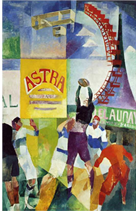
Figure 15. Robert Delaunay The Cardiff Team, Third Version Oil on canvas, 326 x 208 cm, 1913 Musée d'art moderne de la Ville de Paris

purest impressionism” (Marc, “To Delaunay,” 484). This was, as was Enchanted Mill , a rejection of The Cardiff Team’s celebration of modern technology, which Marc believed had robbed the world of intuition and secularized, what he termed, the sacred insights of pure science. In the same letter, however, he reaffirmed his appreciation of Windows in Three Parts , seen the previous fall; and the unusual horizontal format of which would be adopted by Marc in several important paintings of the coming fall and winter. September brought the opportunity at the “Erster deutscher Herbstsalon” to see Delaunay’s most recent paintings. Translating sun- and moonlight into color and form, they produce a gyrational force within the canvas that clearly intrigued Marc, as evident in a series of paintings done after seeing the exhibition. Marc’s general response to the exhibition is found in a letter to Kandinsky: