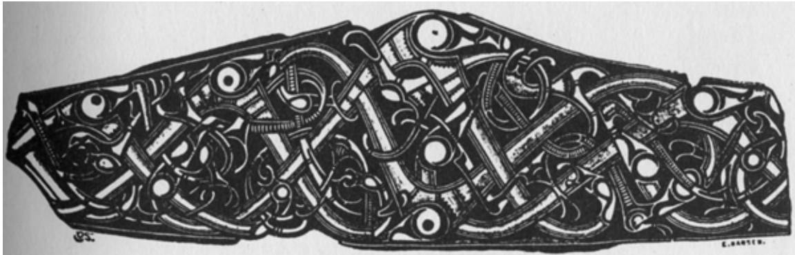
Figure 6. Rendering of a bronze clasp from Gotland, Sweden for Bernhard Salin, Die altgermanische Tierornamentik, Stockholm, 1904, as reproduced in Wilhelm Worringer, Formprobleme der Gotik, Munich 1910.

The artistic volition toward abstraction was based, in contrast, on a psychological insecurity about the outside world, which was experienced as an extended, disconnected and bewildering nexus of phenomena. This psychological condition compelled the removal of depicted objects from the arbitrariness of the external world, to eternalize them by approximation to abstract forms and to thus find a point of tranquility and refuge from appearances. Space and volume were suppressed in favor of what Worringer termed the geometric-crystalline. While he gave various examples of this abstract style, his primary one was Northern animal style of the first millennium A.D. ( Figure 6 ), although he hesitated to call it