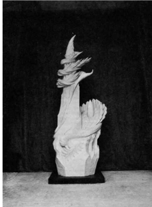
Figure 2. Hermann Obrist Movement, Model for Werkbund Exhibition, Cologne, 1914. Mounted photograph Museum für Gestaltung, Zürich

abstraction, which was stimulated, in part, by Theodor Lipps' ideas about the role of empathy in aesthetic response. Abstraction and Empathy: A Contribution to the Psychology of Style , Worringer's dissertation and first book, became, in turn, a text that encouraged German Expressionist artists in their own use of "expressive abstraction" during the years around 1914. This essay will explore trajectories of this visual and textual discourse, paying particular attention to their nexus during 1914 in the work of Franz Marc.