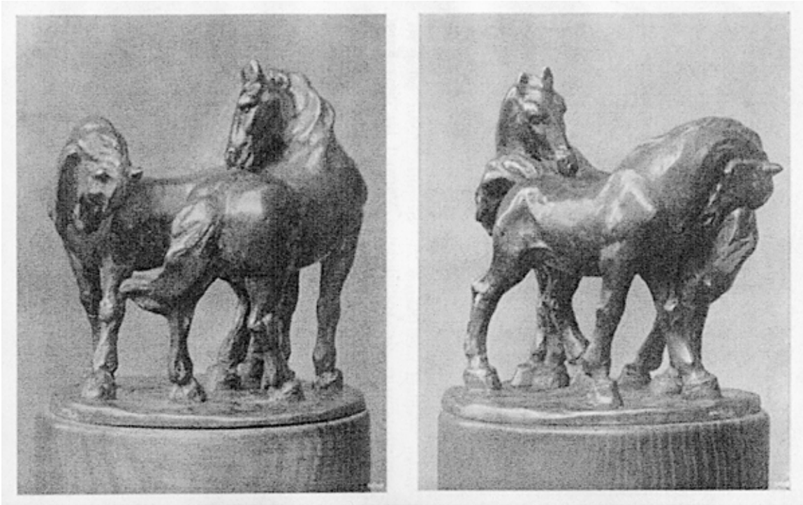
Figure 10. Franz Marc, Two Horses, Bronze, H. 16.4 cm, 1908-09, Final illustration in Reinhard Piper, Das Tier in der Kunst, Munich, 1910

My goals are not in the field of animal painting in particular. I am looking for a good, pure and light style in which at least part of what we modern painters have to say will show through. I am trying to intensify my feeling for the organic rhythm of all things. I am striving to empathize pantheistically with the quiver and flow of blood in nature, trees, animals, the air. I am striving to make pictures of this, with new movements and colors, that defy our old easel paintings. . . . [T]he new French generation is caught up in a race to this goal. But, strangely enough they carefully steer clear of the most natural subject for art of this kind - the animal picture. I can see no better way of "animalizing" art, as I should like to call it, than the animal picture. This is why I seize it. With a van Gogh or a Signac, everything has become animalized, the air, even the boat resting on the water and above all, the painting itself: these pictures no longer resemble what used to be called "pictures." My sculpture is a tentative