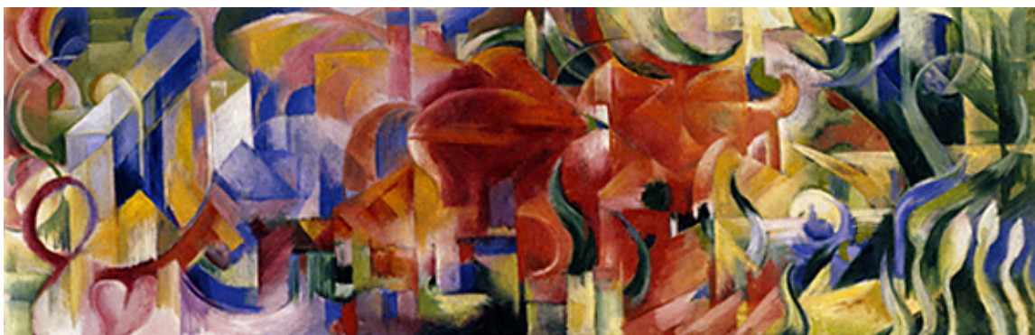
Figure 17, Franz Marc, Playing Forms , Oil on canvas, 56.5 x 170 cm, 1914 Museum Folkwang, Essen

in September 1914, Marc created not only some of his most well known animal paintings, but also a series of abstractions. He wrote nothing about this work in surviving letters from that period, although the issue of abstraction is prominent in “The 100 Aphorisms/The Second Sight,” which was written at the front during Winter 1914-15 and probably intended to be published like two other essays