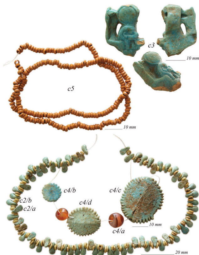
Figure 3. Beads and pendants from Tomb 262 (modern stringing).

addition to clay ones, comprise an extraordinary group in Tomb 191. It includes 2,177 shells of Bellamya sp. (Van Damme 1984: Figure 5) (Figure 5: T191 d1, d1/f, d1/i), 27 shells of Melanoides tuberculata (Van Damme 1984: Figure 24a, 25) (Figure 5: T191 d1, d1/h), and 13 shells of Natica sp. (Figure 5: T191 d1/g). While Red Sea shells are known from Napatan and Meroitic bead repertoires in the Nile Valley, the use of perforated Nile shells in Roman-dated beadwork is seldom mentioned in the literature. Two beads made of faience and drawn glass, respectively, from Tomb 191 date the context to the Meroitic Period.