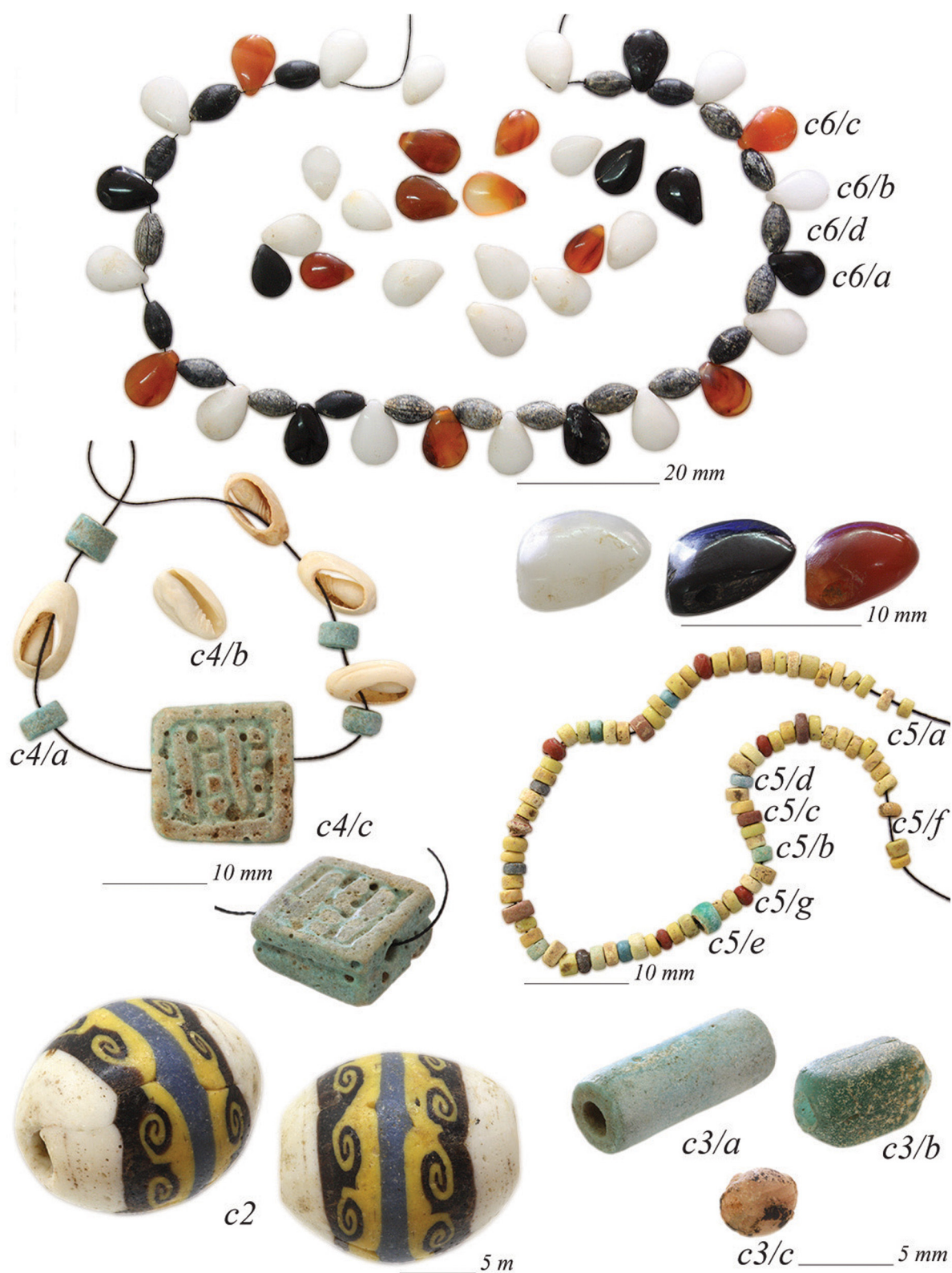
Figure 2. Beads and pendants from Tomb 192 (modern stringing).