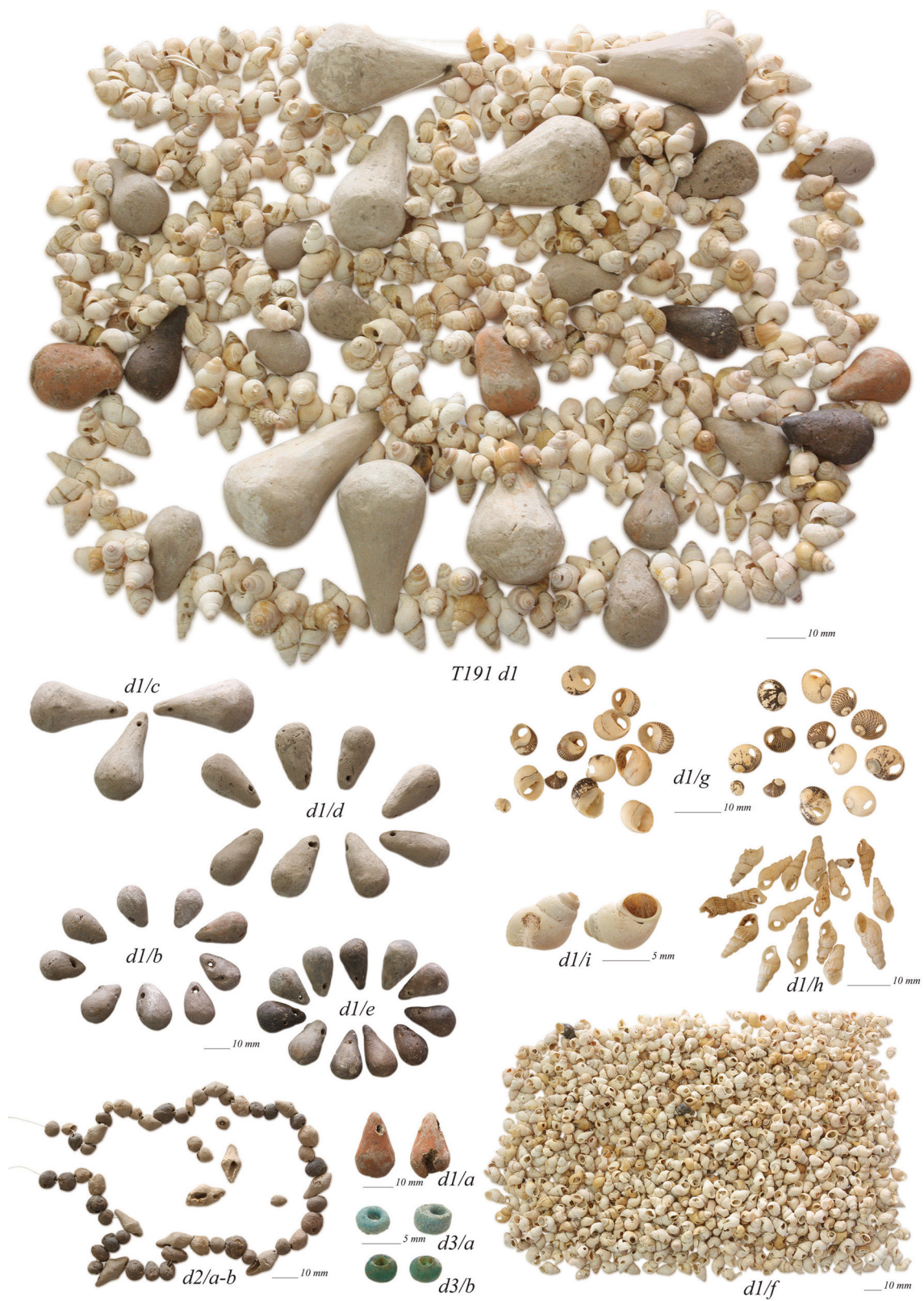
Figure 5. Beads and pendants from Tomb 191 (modern stringing).