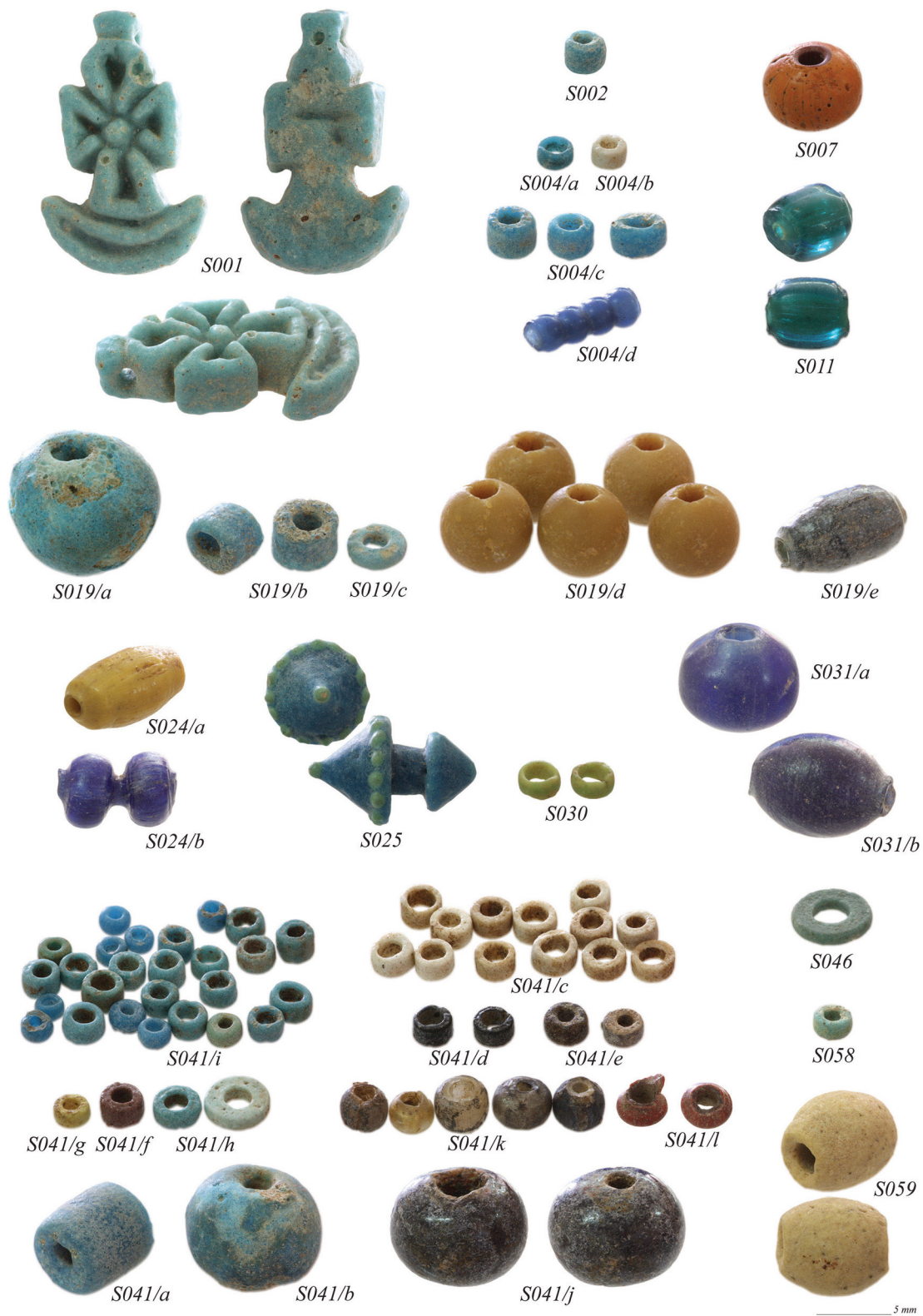
Figure 13. Surface-collected beads, pendants, and ear stud.