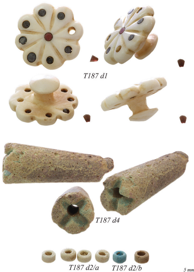
Figure 11. Beads and stone ear stud from Tomb 187.

and an oblong one of cobalt blue glass (Figure 13: S031/b). The surfaces of some beads are crackled and characterized by different glass hues. They are blue, yellow, and turquoise in color (Figure 4: T293 c2/b, d, i). Five globular beads of mustard-gold-colored glass (Figure 13: S019/d) found on the surface with other Meroitic beads may be of wound construction. A polychrome wound bead of opaque blue glass is trail-decorated with a translucent dark blue wavy band around the middle (Figure 8: T176 c2). It measures 9.7 mm in diameter.