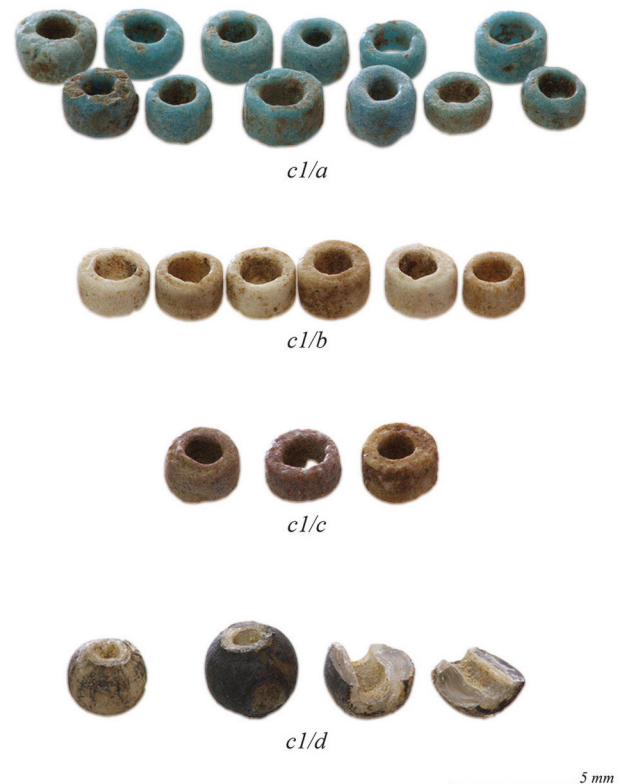
Figure 12. Faience and metal-in-glass beads from Tomb 188.

A barrel-shaped bead formed by the joining technique is composed of eight cane slices in a rolled-pad pattern of dark purple and yellow with the addition of a central blue band and white ends (Figure 2: T192 c2). Spaer (2001:42)