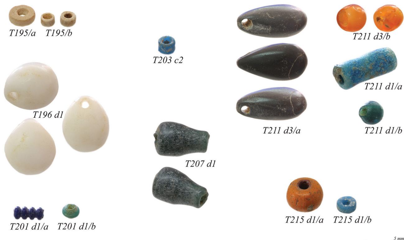
Figure 10. Beads and pendants from Tombs 195, 196, 201, 203, 207, 211, and 215.

A large globular black bead, most likely of drawn manufacture, exhibits six longitudinal white stripes (Figure 4: T293 c2/g). Although it has rough ends, traces of the segmented portion are preserved there.