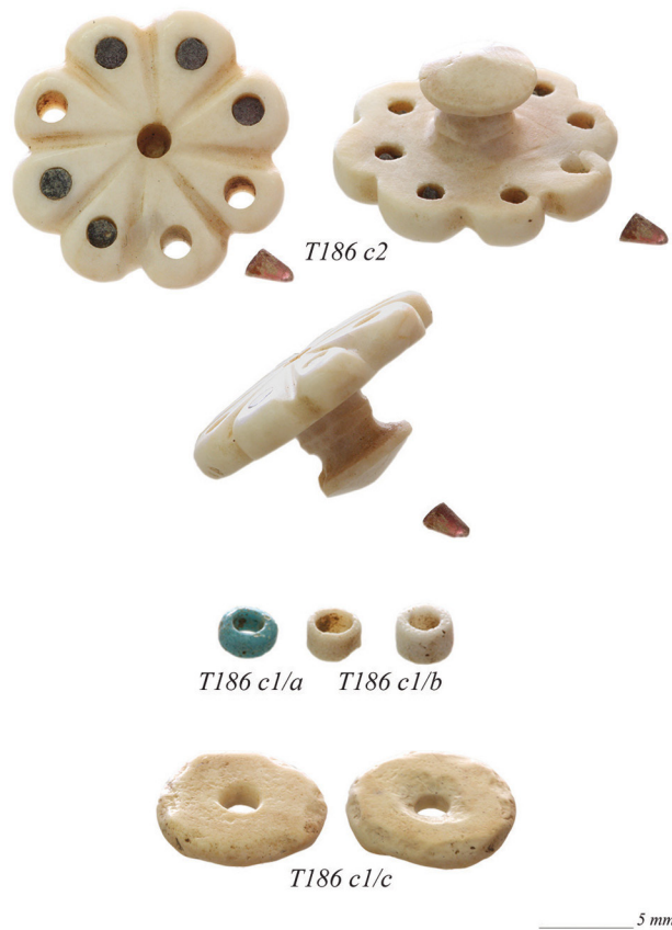
Figure 9. Beads and stone ear stud from Tomb 186.

An ankh-above-crescent pendant is present in the Sedeinga adornment assemblage (Rilly and Francigny 2005: Plate XXIV) (Figure 13: S001). Such a pendant was also found at Sai (Then-Obluska 2015a) and at Nag Shayeg (Pellicer Catalan 1963:96, Figure 23, Type 58). Similar pendants made of silver were found in the robbers' passage at Noubadian Ballana (Emery and Kirwan 1938, I:83, 216, 1938, II: Plate 48 D, B-4-27). The same motif was used on Meroitic pottery and the ankh-above-crescent was also noted as a stamped impression on clay seals on amphorae from Noubadian Qustul (Emery and Kirwan 1938, II: Plate 115-28).