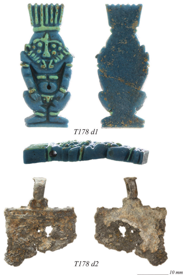
Figure 14. Faience and metal pendants from Tomb 178.

in Roman beads (Arveiller-Dulong and Nenna 2011:205, no. 277:4; Kucharczyk 2010:125), a pastille dated between the 1st and 4th centuries A.D., a plaque fragment of Egyptian or Italian production, fragments of a plate dated to the 4th century A.D. (Arveiller-Dulong and Nenna 2011:341, no. 559, 412, nos. 703-704, 416, Add. 1 and 3), and fragments found near Heis on the north Somali coast (Stern 1991: Figure 6.1). A pendant of this glass from Coffin B in Tomb LXVI at al-Bagawat, Kharga Oasis, Egypt, is dated to the 4th-7th centuries A.D. (MET 31.8.5).