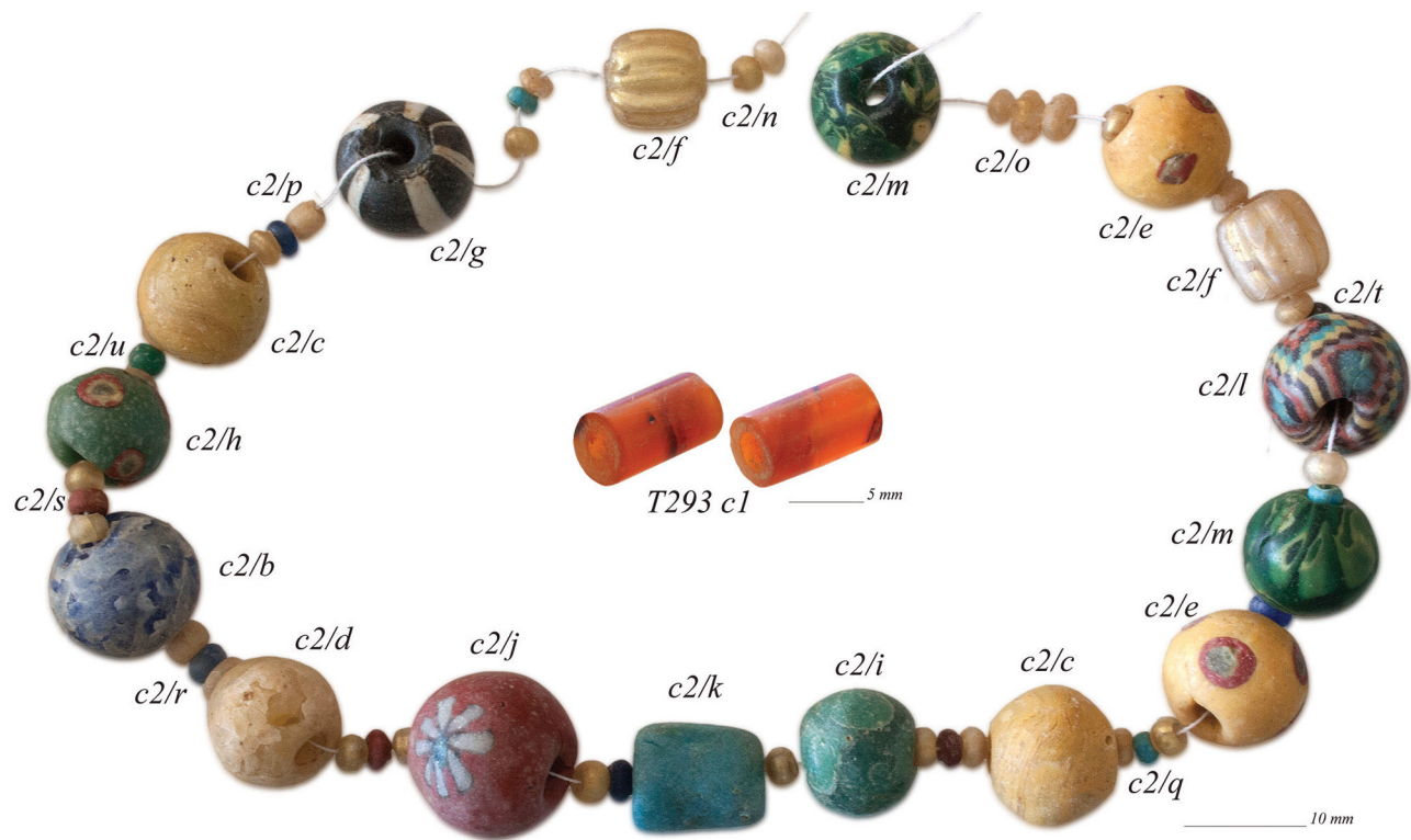
Figure 4. Beads from Tomb 293 (modern stringing).

A small carnelian barrel bead ca. 5 mm in diameter is one of the most common types in the Meroitic bead repertoire (Figure 10: T211 d3/b). It is roughly shaped with a highly polished surface. A saw mark that facilitated setting the drill in place is discernable adjacent to the larger end of the truncated-conical perforation.