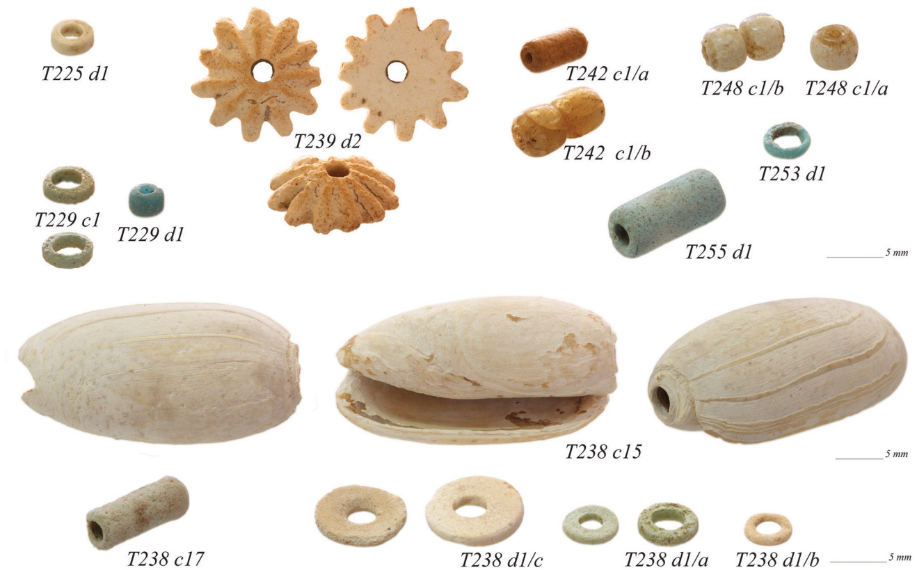
Figure 6. Beads from Tombs 225, 229, 238, 239, 242, 248, 253, and 255.

adult female burials. It is ascribed to the IIIB type group (Williams 1991b: Plate 76c, OIC E22559) which dates to around the second half of the 2nd century A.D. (Williams 1991a:18-19).