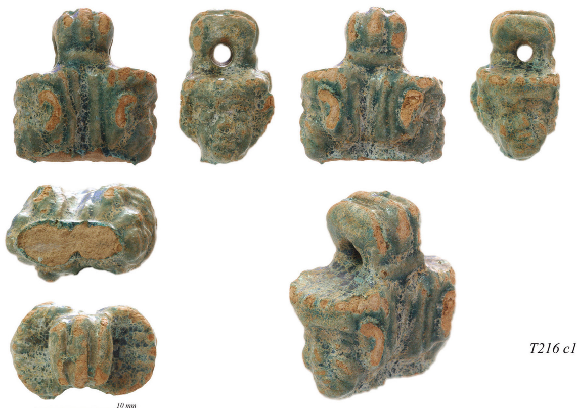
Figure 15. Broken amulet in the form of two men's heads back to back from Tomb 216.