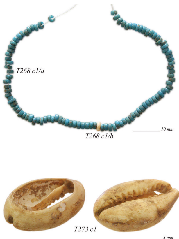
Figure 7. Faience and cowrie-shell beads from Tombs 268 and 273 (modern stringing).

Among larger beads, the blue globular (Figure 13: S019/a, S041/b) and white barrel examples (Figure 13: S059) are surface finds, as is a blue long cylinder (Figure 13: S041/a). The latter is also present in a Meroitic necklace in Tomb 293 (Figure 4: c2/k).