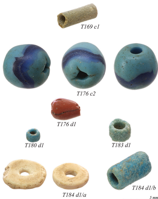
Figure 8. Beads from Tombs 169, 176, 180, 183, and 184.

The lotus or jasmine flower-bud bead (Beck 1928: Figure 24, A.1.e) is a long truncated cone with one decorated end (Figure 11: T187 d4). Similarly shaped beads were used for horse (Dunham 1950:110; Reisner 1919:252; MFA 21.10569a, 21.10560, 21.10567) and child adornments during the Napatan Period (Vercoutter 1975: Figure 5.1). A flower bud with a base divided into quadrants is also present in the Meroitic bead repertoire; e.g., at Meroë (Dunham 1963: Plate S, XIIIc) and with a child burial at Missiminia (Vila 1982:77-78, Figure 73.3b).