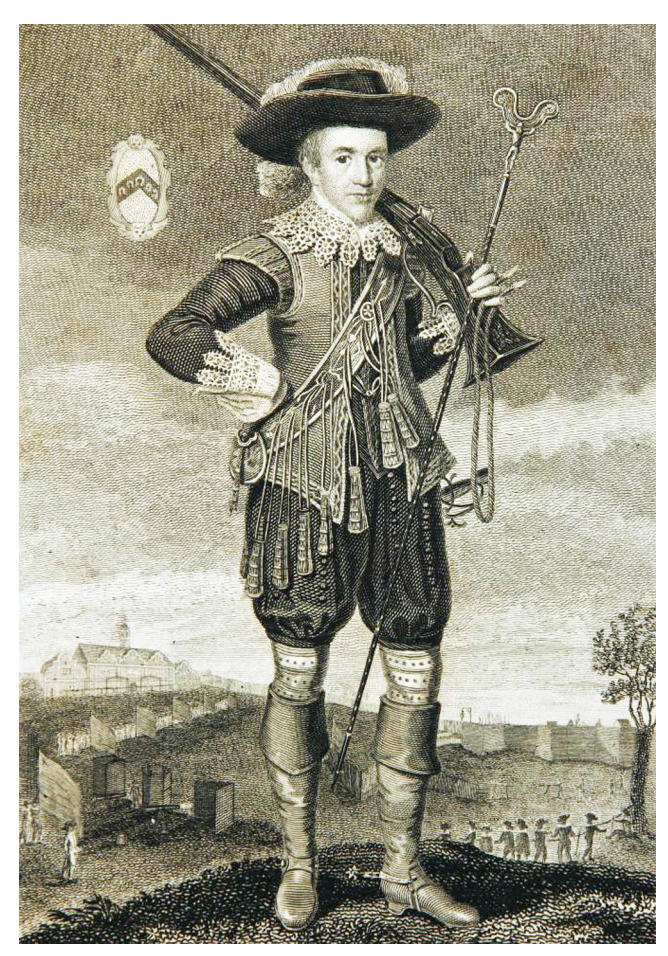
Figure 1. Sir Nicholas Crisp (published in 1795 by Cadell and Davies, London).

What is now known as Hammersmith Embankment was the former site of Brandenburgh House, the private estate of Sir Nicholas Crisp (1598-1666), a wealthy London merchant (Figure 1) who was deeply involved in the West African trade. His involvement with the Company of Adventurers of London, better known as The Guinea Company, began