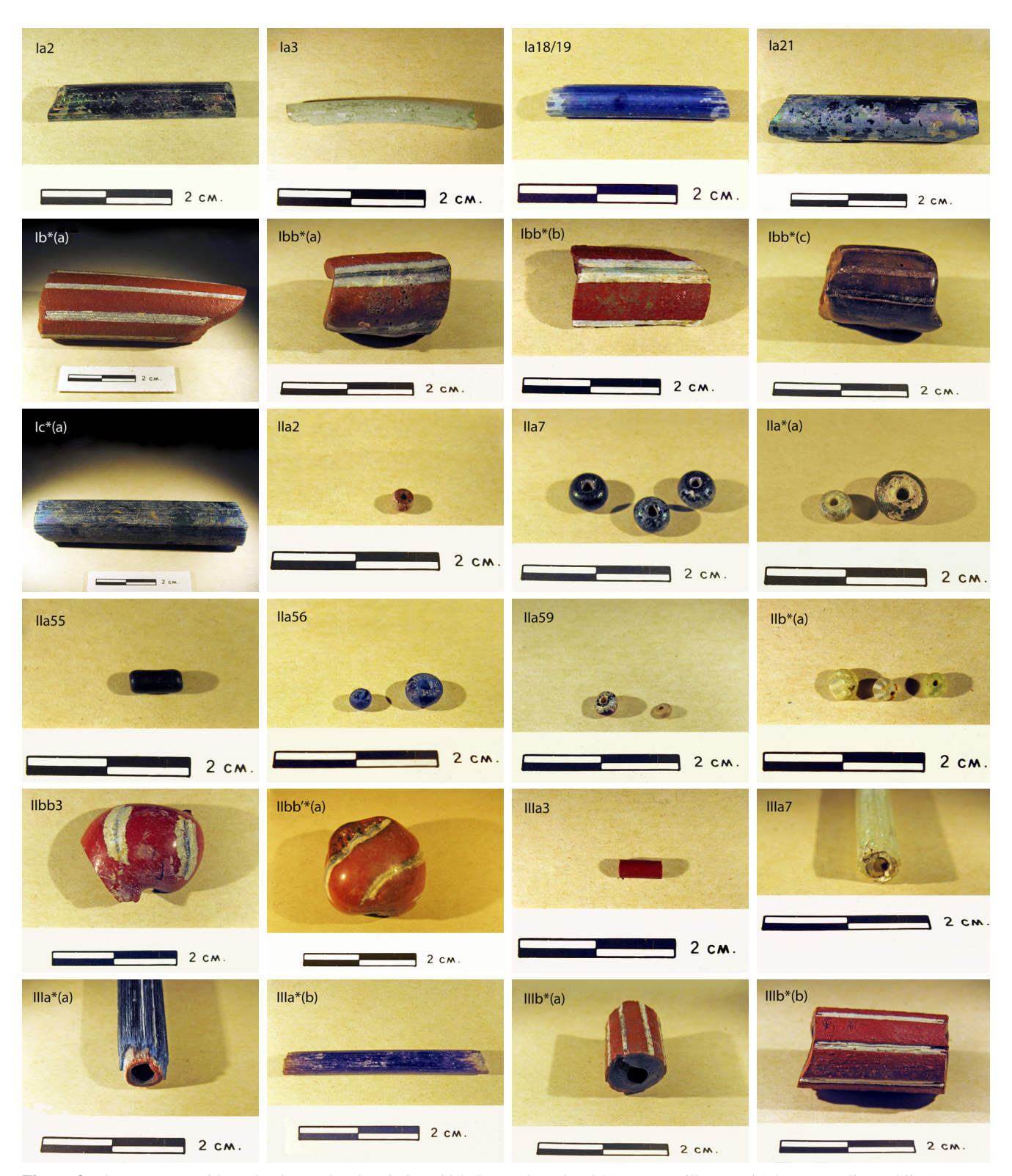
Figure 3. The Hammersmith Embankment bead varieties; Ibb*(d), IIa12, and IVb*(c) are not illustrated.