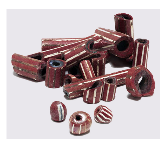
Figure 2. An assortment of production tubes and rejected beads from the Hammersmith Embankment excavations.

While a full report on the archaeological findings at Hammersmith Embankment has not been published as yet, color images of some of the recovered beads and production tubes appeared in several short printed and Internet articles on the site (e.g., Jamieson 2007; Moss 2007). The beads (Figure 2) appeared to be very similar to specimens encountered in early-17th-century beadmaking wasters excavated in Amsterdam (Karklins 1985) and at several contemporary aboriginal sites in eastern North America. In hopes that an examination of the Hammersmith material might help differentiate beads produced in London from those manufactured in Holland and elsewhere, Karklins