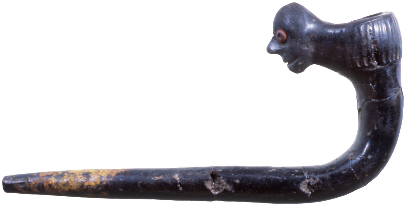
Figure 2. A Seneca effigy ceramic smoking pipe from the Dann site, New York, with inlaid red glass beads for eyes (RF 900-28); 21.5 cm long (on loan to the Rochester Museum and Science Center, courtesy of the Rock Foundation).