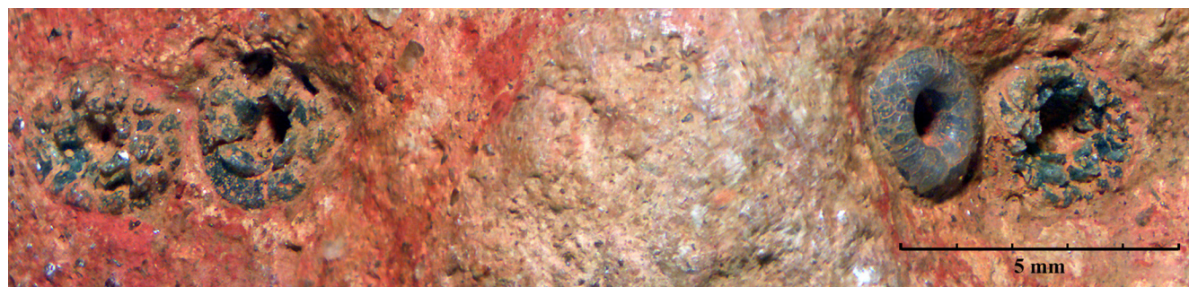
Figure 5. Close-up of glass seed beads inlaid in the Ocmulgee pipe (courtesy of the National Park Service, Southeast Archaeology Center, Tallahassee).

One difference between the Seneca and Creek pipes concerns their use of glass beads, with one bead per eye on the Dann specimen and two per eye on the pipe from Ocmulgee. The beads inlaid in the Creek pipe are badly deteriorated, presumably due to damage from firing the ceramic pipe. The exposed surfaces of three of the four glass beads have cracked and fallen away to reveal blocky remnants embedded in the pipe's clay matrix. The pattern of longitudinal fractures suggests these are drawn beads (Kidd and Kidd 1970: Type IIa). All four appear to be a blue-green