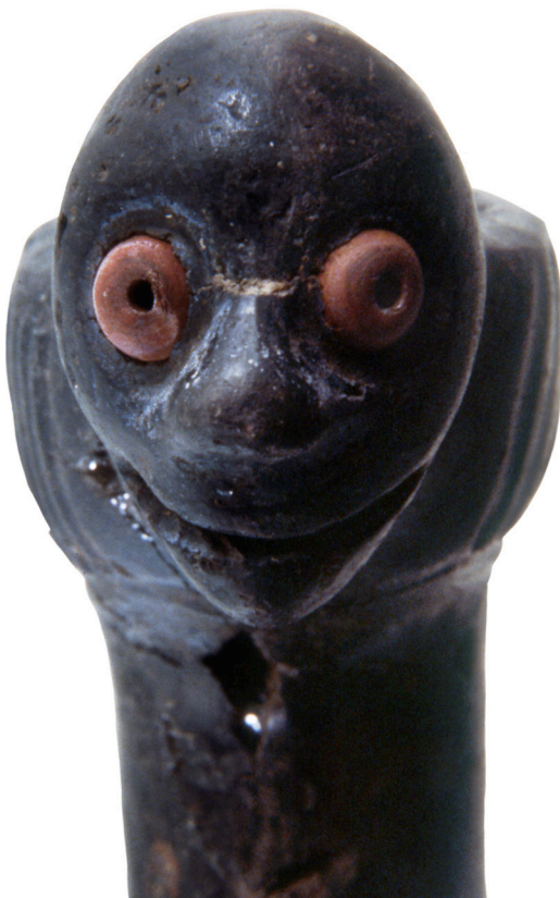
Figure 3. Detail of the face of the effigy smoking pipe from the Dann site (on loan to the Rochester Museum and Science Center, courtesy of the Rock Foundation).

Florida, is actively cataloging the Ocmulgee backlog. In the course of that retrospective processing, Coleman noticed the presence of glass beads pressed into the eye sockets of a crudely modeled human-face pipe (Figures 4-5). Unlike the Seneca examples, this Creek pipe bowl fragment has two glass seed beads in each eye recess, attributes evidently overlooked or unrecorded at the time of excavation. The artifact's original catalog card describes object "39-7751/1B1 3" simply as an "Effigy of Human Face, Painted Red" from Mound D. Archived field and laboratory notes do not yield any more specific provenience for the find.