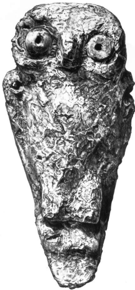
Figure 1. An owl-effigy smoking pipe made of lead or pewter inlaid with blue glass beads for eyes (RF 21078) from the Seneca Dann site in western New York; 5.4 cm high (on loan to the Rochester Museum and Science Center, courtesy of the Rock Foundation).

364; Miller and Hamell 1986:319). Both pipe fragments are effigy forms with eyes represented by glass beads. One is a zoomorphic blue-eyed owl made of lead (Figure 1), perhaps made by Dutch craftsmen for trade to the Indians (Bradley 2006:170; Veit and Bello 2004:192). The other is an anthropomorphic red-eyed human head in ceramic, certainly Native-made (Figures 2-3). Hamell (1983) interpreted these striking combinations of Native and European motifs and materials as evidence for the ready incorporation of novelty into traditional Native categories of the sacred – glass and lead considered as newfound symbolic counterparts of the translucent quartz crystals and mica, reflective copper, and lustrous white marine shell traditionally considered sacred across Native North America. Far from replacing traditional sacra, these newly adopted sacred media were creatively deployed in a fluorescence of original forms that metaphorically evoked long-held beliefs in otherworldly powers. “[I]n the initial phases of intercultural trade