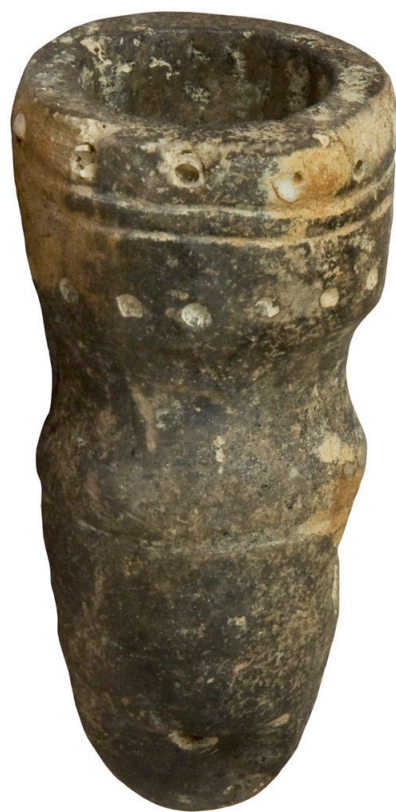
Figure 8. Vasiform ceramic smoking pipe of Seneca origin with inlaid glass beads from the Huntton site (RF 6240/159) (on loan to the Rochester Museum & Science Center, courtesy of the Rock Foundation).

Granted the very small sample sizes we have at hand, these similarities across a huge geographical area are all the more remarkable. What could account for this near homogeneity in bead color, size selection, and placement on pots (and one pot-shaped smoking pipe) from a wide range of Native American contexts? We suspect several processes are at play. First of all, Schuyler Poitevent may not have been far off when he identified the heat-altered beads on his sherd from Martin’s Bluff as pearls. The native predecessors to glass beads all over North America and the Caribbean were made from marine shell, which opaque white glass