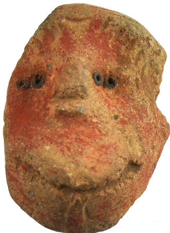
Figure 4. The human-effigy pipe from Ocmulgee, Georgia, with inlaid glass bead eyes.

reaching to the area of Mound D (Bigman 2010; Bigman and Cornelison 2013).