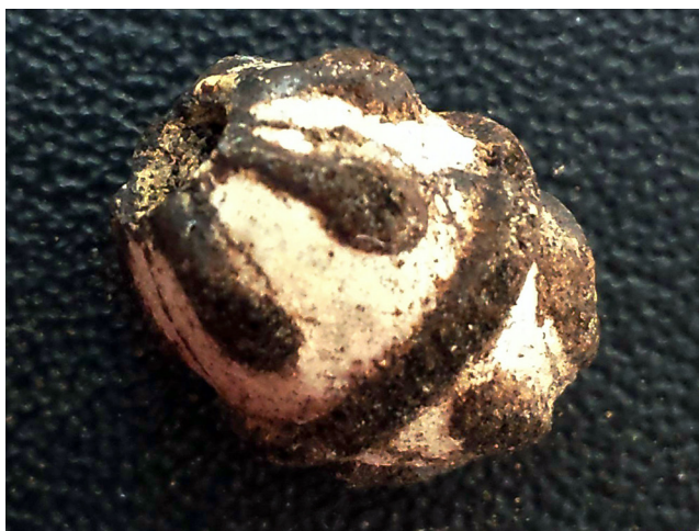
Figure 6. Type 4A from Jamestown, Virginia (photo: Bly Straube; collection of the Jamestown Rediscovery Foundation).

The Jamestown specimen is the only one found in a tightly dated context. It was recovered from the well John Smith ordered the colonists to dig in 1608, which was filled in upon the arrival of Lord De La Warr in 1610 (Merry Outlaw 2016: pers. comm.). This find confirms that frit-core beads spill over into the first decade of the 17th century. Thus, while the 1580-1600 date range is viable for frit-core beads in southern Ontario, it seems to be a bit restrictive for some of those found elsewhere. A more accurate date range for beads recovered from sites outside southern Ontario might be 1560-1610 or even later.