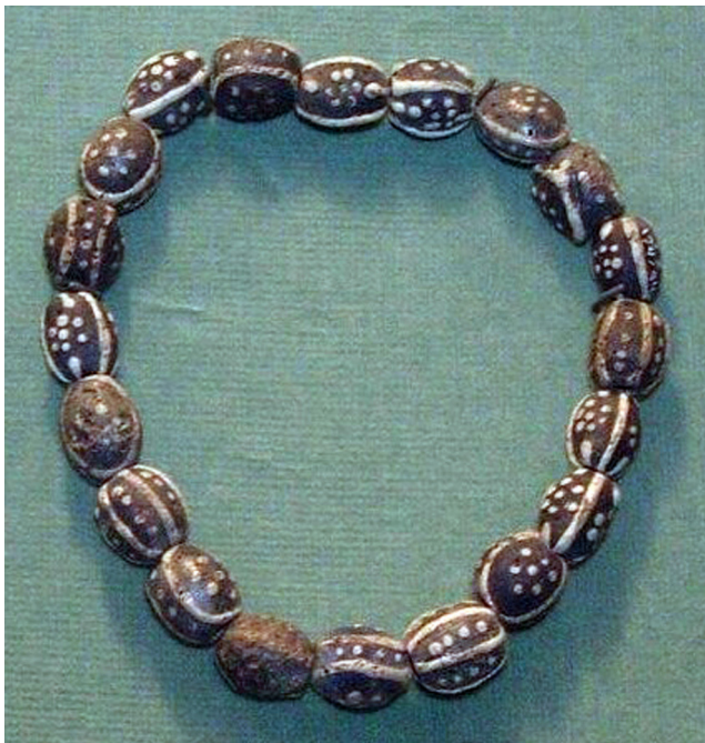
Figure 3. Frit-core beads from the Adams site, New York, showing Types 1, 2, and 5 (on loan to the Rochester Museum and Science Center; courtesy of the Rock Foundation).