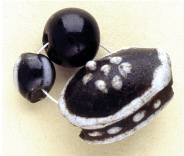
Figure 4. Type 1 with associated beads from Tadoussac, Quebec (cat. no. M2185A [detail]).

1993:70), though Loewen (2016:276, 284) feels that frit-core beads could have been introduced into the general region (Acadia and Tadoussac) from France as early as 1559. Thus, the beads from the three Quebec sites might also have arrived this early.