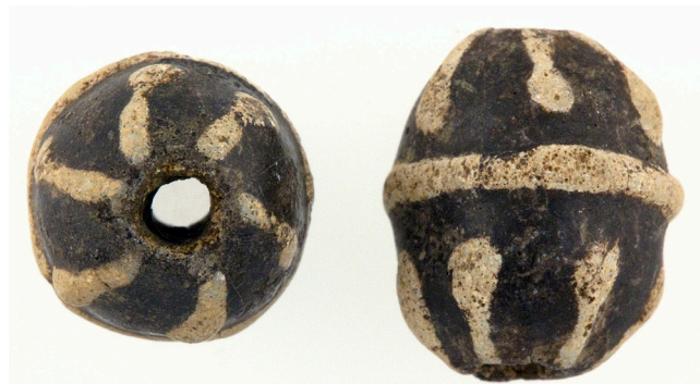
Figure 5. Type 4 from the Kleinburg ossuary.

The Culbertson and Adams sites are assigned to the period 1570-1590, based on a revised chronology for Seneca sites in western New York (Sempowski and Saunders 2001:6). They were previously attributed to the 1560-1575 period (Wray et al. 1987:115, 211). The nearby Factory Hollow site is dated to 1610-1625 (Sempowski and Saunders 2001:5), while the Barker site in eastern New York was occupied from about 1600 to 1614 (Bradley 2007:43). The date for the Funk Site in southeastern Pennsylvania is 1550-1600 (Smith and Graybill 1977:57).