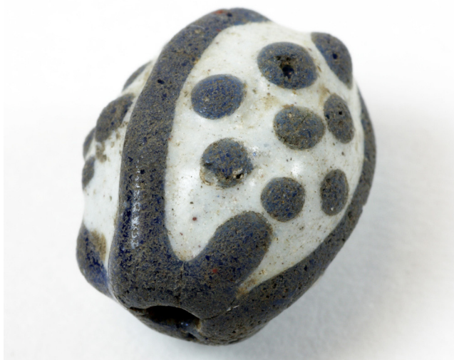
Figure 7. Type 5A bead from Pointe-à-Callière, Montreal, Quebec.

The Jamestown specimen is the only one found in a tightly dated context. It was recovered from the well John Smith ordered the colonists to dig in 1608, which was filled in upon the arrival of Lord De La Warr in 1610 (Merry Outlaw 2016: pers. comm.). This find confirms that frit-core beads spill over into the first decade of the 17th century. Thus, while the 1580-1600 date range is viable for frit-core beads in southern Ontario, it seems to be a bit restrictive for some of those found elsewhere. A more accurate date range for beads recovered from sites outside southern Ontario might be 1560-1610 or even later.