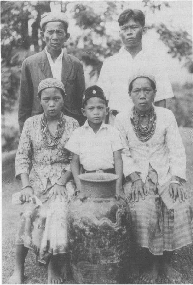
Figure 3. Family group at Rumah Kurus, near Long Tuma (lowlands), posing with a valuable heirloom jar, ca. 1947 (courtesy of the Sarawak Museum). Note the necklaces and bead caps of the women.

slaves were nearly always war captives who became absorbed into the master community's very lowest class. They had to perform a certain amount of corvée labor, and submit to being traded off as part of a high-class dowry payment on occasion.