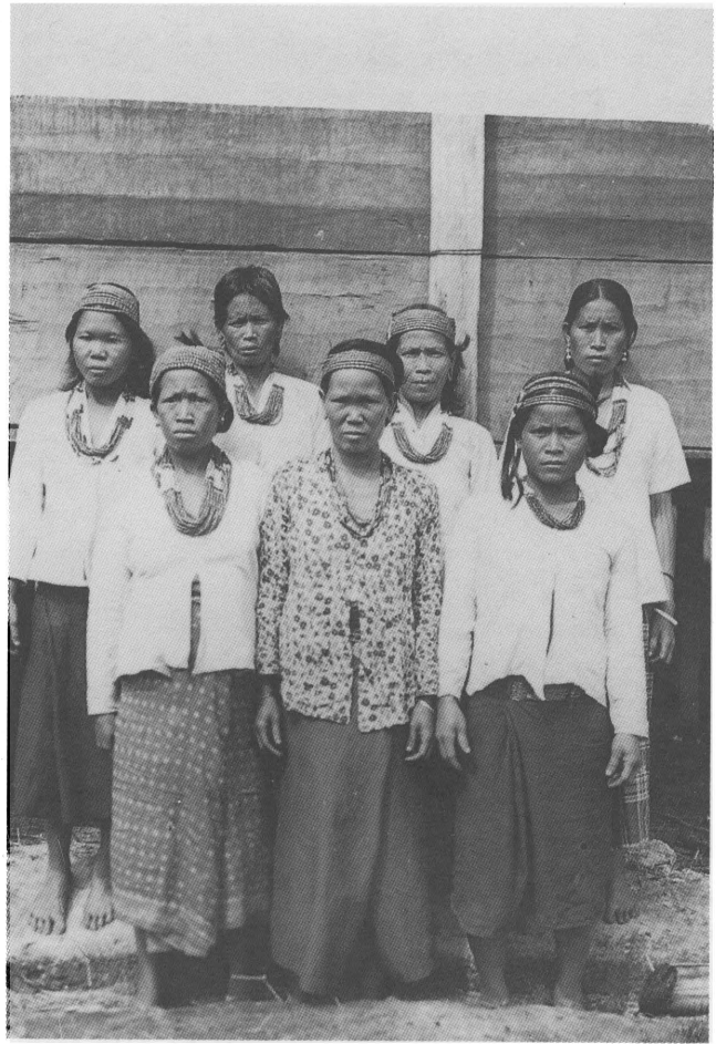
Figure 4. A group of Lun Bawang women from Ba Belawit, Kalimantan (Indonesian Borneo, highlands), ca. 1947. They wear bead caps and multi-strand necklaces.

Beads can be given to a daughter-in-law. Such a gift is usually made after the marriage, as a token of good family relationships. The younger woman does not expect it; the elder is not obliged to give it. Disposal of beads, to a relative or friend, is entirely at the owner's discretion; men refrain from meddling in what is women's business.