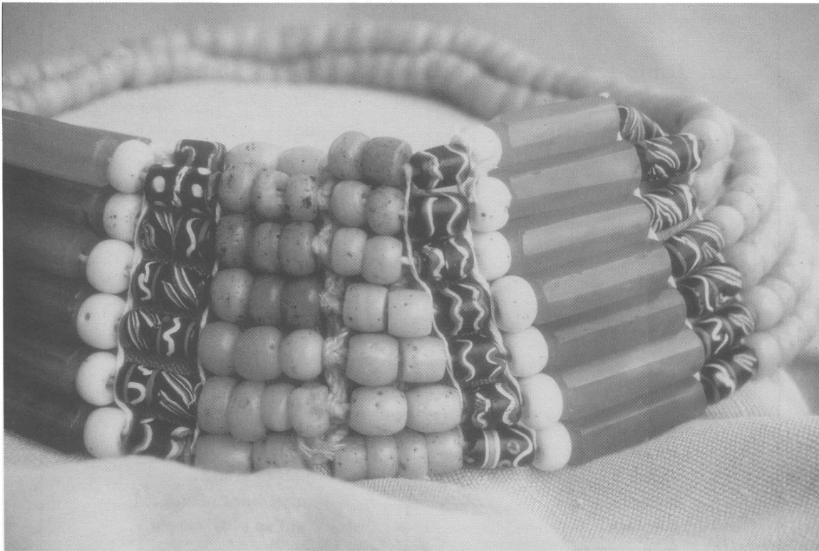
Figure 6. The back portion of a 7-strand pata . Yellow alet birar mon beads comprise the bulk of the cap. Other beads include white monochromes, black specimens decorated with various dark red and white elements, and long, faceted, imitation carnelian beads (photo by H. Munan).

available. Men seem to have worn more beads in the past. The fashion was practically discontinued, but is now being taken up again.