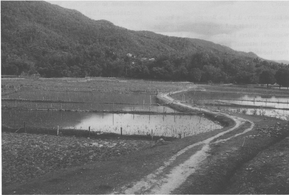
Figure 2. The Lun Bawang heartland, the fertile upland plains of Ba Kelalan.

logging roads which cut ever deeper into the interior. But the civilized way to travel to and from this fertile, isolated, highland valley is by light plane.