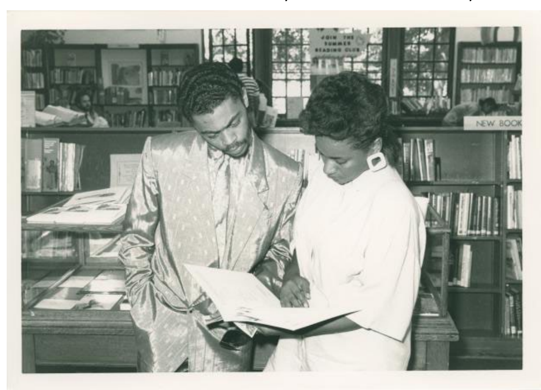
A photograph from The Gallery at the opening of the Black Resource Center. Photo credits: Fred Caldwell. Digital Publisher: Multnomah County Library. In copyright. Copyright owner unlocatable or unidentifiable.

On June 19, 1987, the North Portland Neighborhood Library was buzzing with excitement at the official opening of Multnomah County Library's Black Resource Center. There were speeches, music, activities for kids and families. The culmination of a community-led process nearly 20 years in the making, the Black Resource Center was a dedicated space holding a collection of materials of interest to the County's African American community.