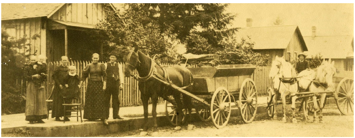
Unknown Volga German family in the Albina district of Portland with horses and wagons. Circa 1900.

tions and groups that focus on Volga Germans—it was founded as an academic entity with a focus on scholarly pursuits. The Center supports the preservation and education of the heritage, history, and accomplishments of the Volga Germans. In 2009, the Center moved into a large dedicated space in the newly built George R. White Library and Learning Center and was able to make all materials previously in storage available to the public. Holdings were cataloged in the library ILS and many images are stored electronically in the library's digital repository; the CU Commons <a href="https://digitalcommons.csp.edu/cup_cvgs/">https://digitalcommons.csp.edu/cup_cvgs/</a>.